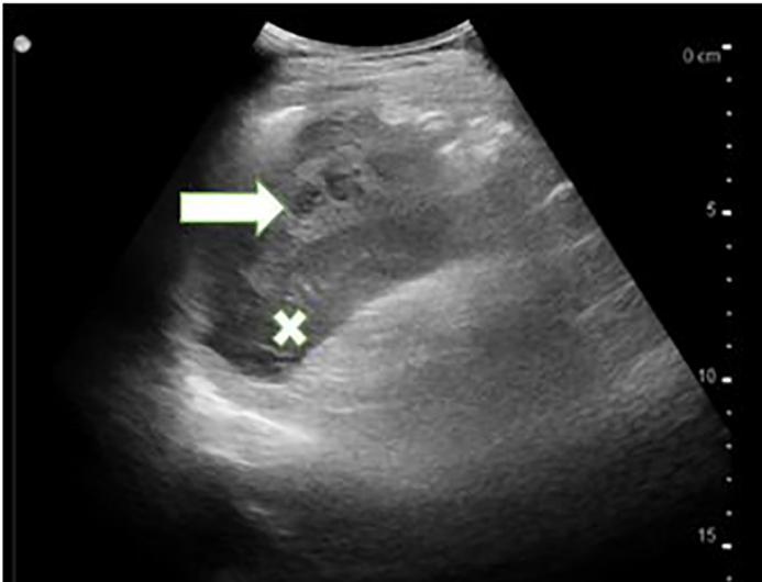
Image 1. Point-of-care ultrasound of the spleen (X) with mixed hypoechoic densities within the splenic capsule (arrow).

A point-of-care ultrasound of the spleen demonstrated mixed hypoechoic densities within the splenic capsule (Image 1). Computed tomography (CT) of the abdomen and pelvis with intravenous contrast showed a perisplenic hematoma with small amounts of blood products extending into the intraperitoneal