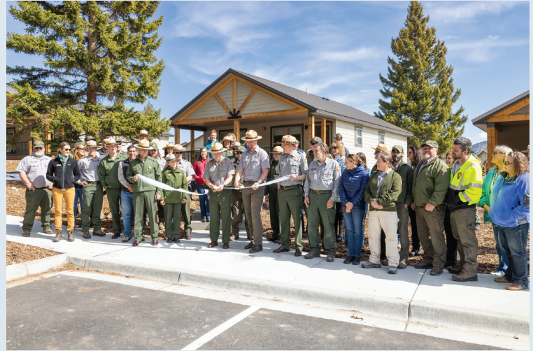
LEFT A former inn in Southwest Harbor, Maine, will now provide housing for up to 10 seasonal employees at Acadia National Park. RIGHT NPS officials cut the ribbon at a ceremony celebrating new employee housing.

it has been rumored that NPF will soon launch a new and very large revolving fund. We can only hope that housing will continue as a high NPF priority for this fund—or else the people who take care of our national parks are “gonna fade away.”