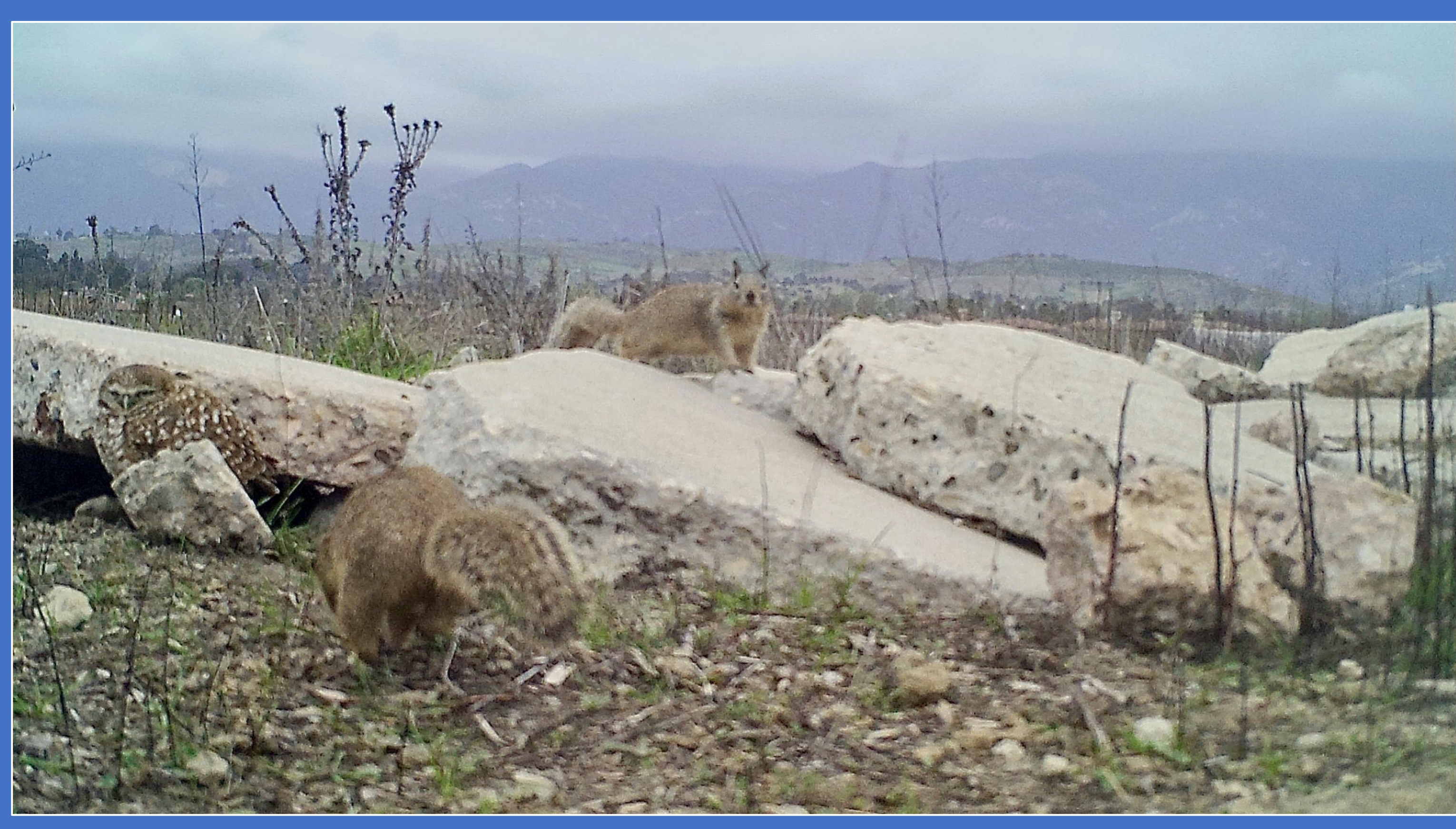
Image 1. Burrowing Owls and California ground squirrels colonize and cohabitate constructed hibernacula on the North Campus Open Space grassland.

<sup>1</sup>Department of Ecology, Evolution, and Marine Biology. University of California Santa Barbara. <sup>2</sup>Cheadle Center for Biodiversity and Ecological Restoration. University of California Santa Barbara.