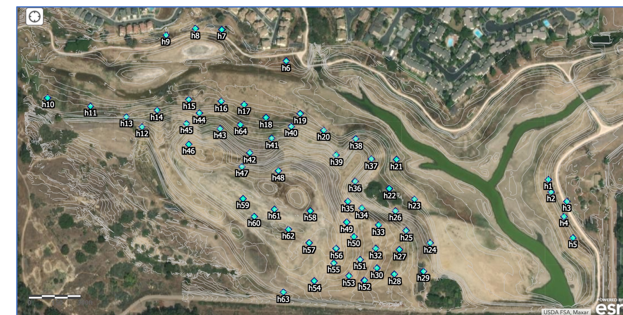
Map 1. NCOS with locations of 63 constructed hibernacula.