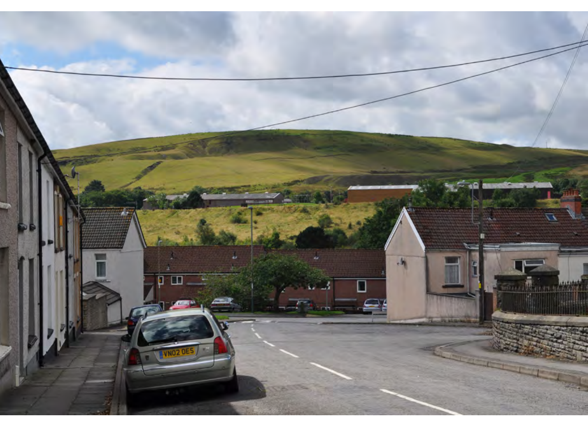
Figure 4: View from Mary Watkins house towards the proposed Nant Llesg coal mine.

I am not going to live here and look at the mountain black. I've seen the mountain black; I've seen how lovely it is now.... So why not start now. Let's think about other methods of energy that won't wreck areas and cause damage to the populations living nearby. Think about people for a change. I mean, I know it's an old thing, we need energy, but there's going to come a time when we have to think about the means of getting energy that is not as polluting.