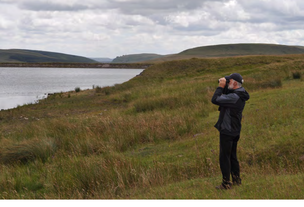
Figure 3: Bob the Birds at Rhaslas Reservoir on the site of the proposed Nant Llesg opencast coal mine.

renewable sources that avoid the destruction of our beautiful surroundings" (UVAG, 2012). Unlike RAFF's campaign against Ffos-y-Frân, however, UVAG has made the decision not to raise the issue of climate change locally, judging that it does not have resonance in the locals' everyday lives; is too complex; and may be counterproductive, given the possible confusion on the part of the citizenry. UVAG members have not heard of, never mind interacted with, the Welsh government's Climate Change Engagement Strategy. However, in a 2012 draft letter to Wales's then minister for Environment and Sustainable Development, John Griffiths, the group does cite climate change. Their letter argues against continuing government support for Aberthaw coal-fired power station, the last of its kind in Wales.