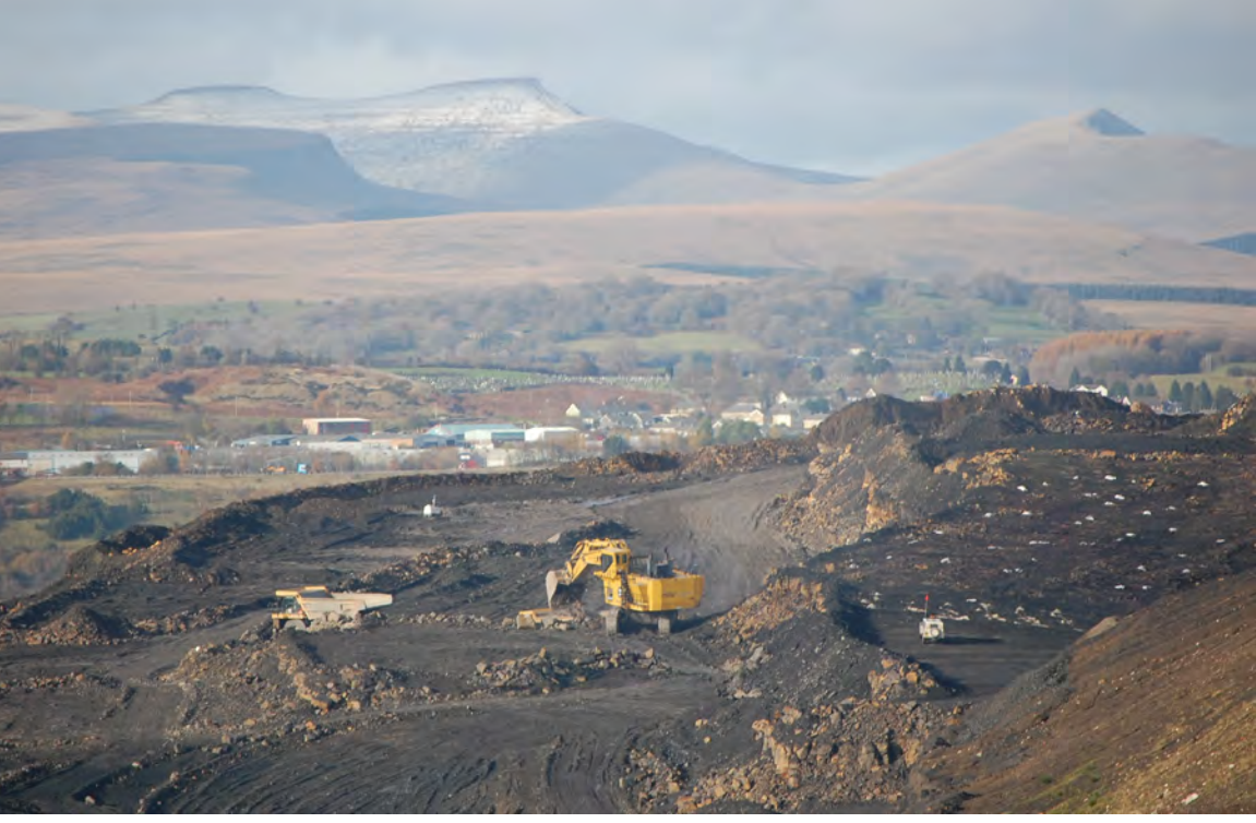
Figure 1: Ffos-y-Frân opencast coal mine with Brecon Beacons National Park in the background.

through the South Wales valleys, especially in the deprived communities of Merthyr Tydfil and Rhymney. The experiences of such marginalized communities must be made public. In this undertaking, we take seriously Jasanoff's challenge to the interpretive social sciences to foster more complex communal, political, spatial, and temporal understandings around climate change (Jasanoff, 2010).