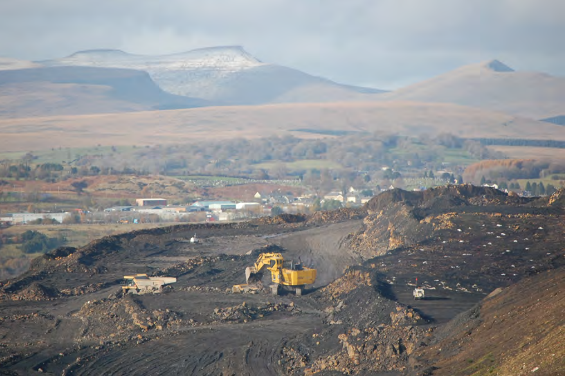
Figure 1: Ffos-y-Frân opencast coal mine with Brecon Beacons National Park in the background.