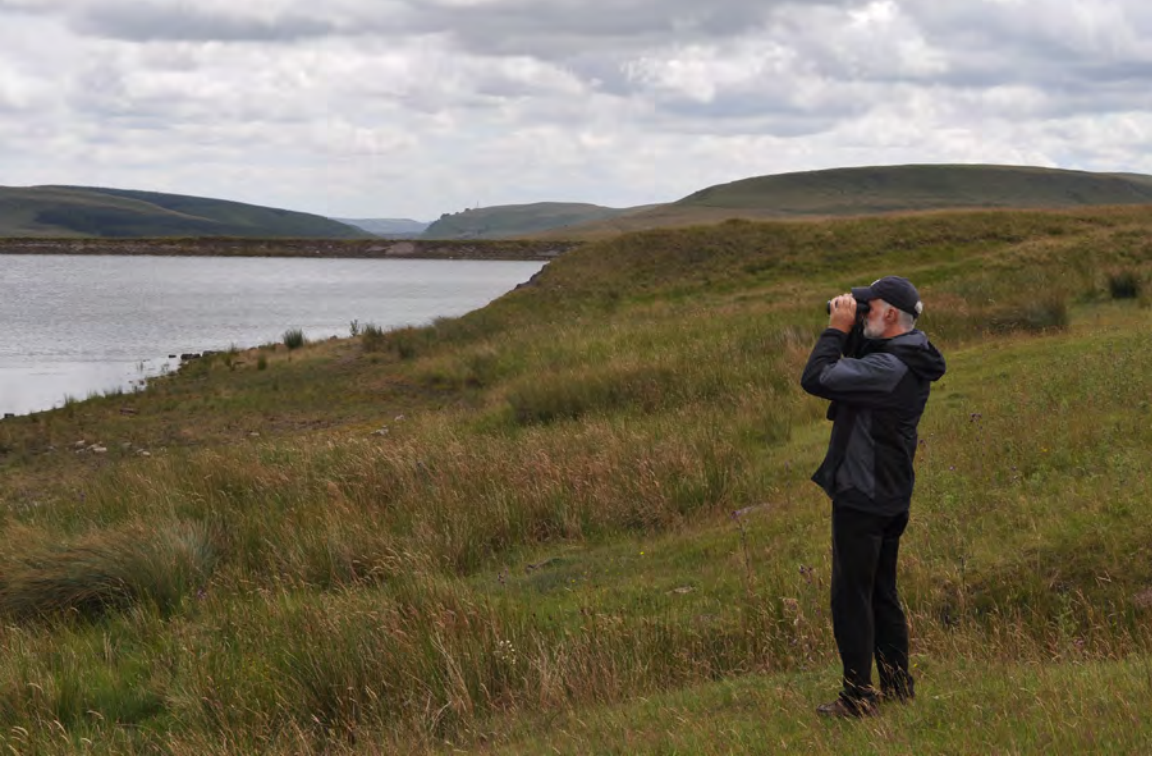
Figure 3: Bob the Birds at Rhaslas Reservoir on the site of the proposed Nant Llesg opencast coal mine.

renewable sources that avoid the destruction of our beautiful surroundings” (UVAG, 2012). Unlike RAFF’s campaign against Ffos-y-Frân, however, UVAG has made the decision not to raise the issue of climate change locally, judging that it does not have resonance in the locals’ everyday lives; is too complex; and may be counterproductive, given the possible confusion on the part of the citizenry. UVAG members have not heard of, never mind interacted with, the Welsh government’s Climate Change Engagement Strategy. However, in a 2012 draft letter to Wales’s then minister for Environment and Sustainable Development, John Griffiths, the group does cite climate change. Their letter argues against continuing government support for Aberthaw coal-fired power station, the last of its kind in Wales.