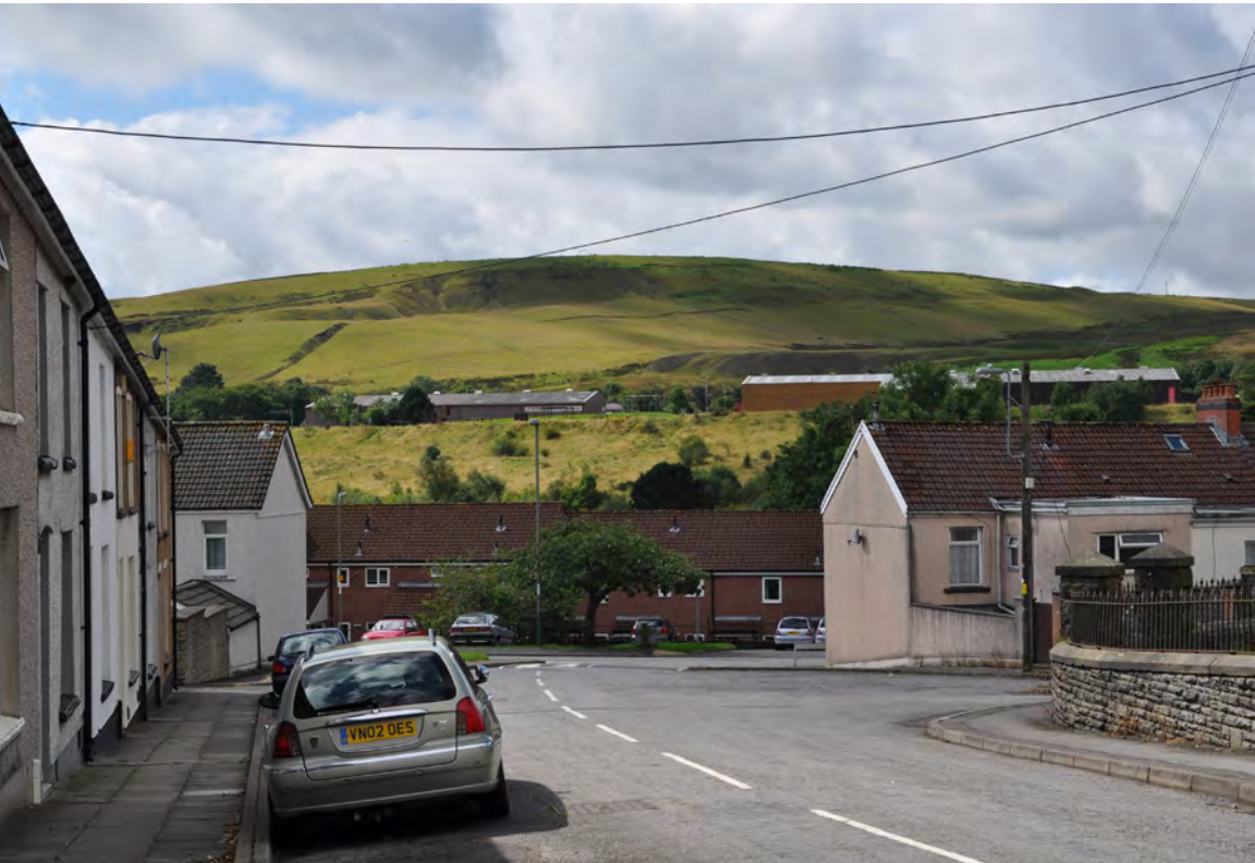
Figure 4: View from Mary Watkins house towards the proposed Nant Llesg coal mine.

I am not going to live here and look at the mountain black. I've seen the mountain black; I've seen how lovely it is now. . . . So why not start now. Let's think about other methods of energy that won't wreck areas and cause damage to the populations living nearby. Think about people for a change. I mean, I know it's an old thing, we need energy, but there's going to come a time when we have to think about the means of getting energy that is not as polluting.