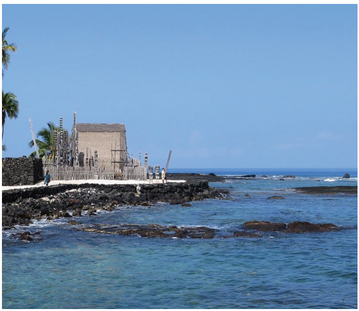
Pu'uhonua o Hōnaunau National Historical Park. The older image (left) is from the 1960s. The more recent photo (right) shows a restored platform after a large storm. Native Hawaiians have deep connections to what is now the park and they are still stewards of the landscape. https://www.nps.gov/puho/learn/historyculture/hale-o-keawe.htm NATIONAL PARK SERVICE

develop a framework for prioritizing climate adaptation strategies for vulnerable archaeological sites. We shared our previous efforts at developing a framework for measuring the relative significance of historic buildings (Fatorić and Seekamp 2018) and provided inundation projection maps of a few archaeological sites with known associations to the Tribal Nations represented on the committee. Before we could even ask about what they thought might be priorities for their heritage sites, members of the committee challenged our approach and its focus on prioritization as not being culturally sensitive to their Ancestors and expressed that proposing to do so created unnecessary psychological harm. The meeting ended—after some excellent feedback and productive sidebar dialogue—with some committee members agreeing to host a meeting of Tribal historic preservation officers (THPOs) and/or Elders from the Tribal Nations to decide if and how they would engage with us. The COVID-19 pandemic disrupted the momentum for continued engagement but provided the project team time to rethink its approach.