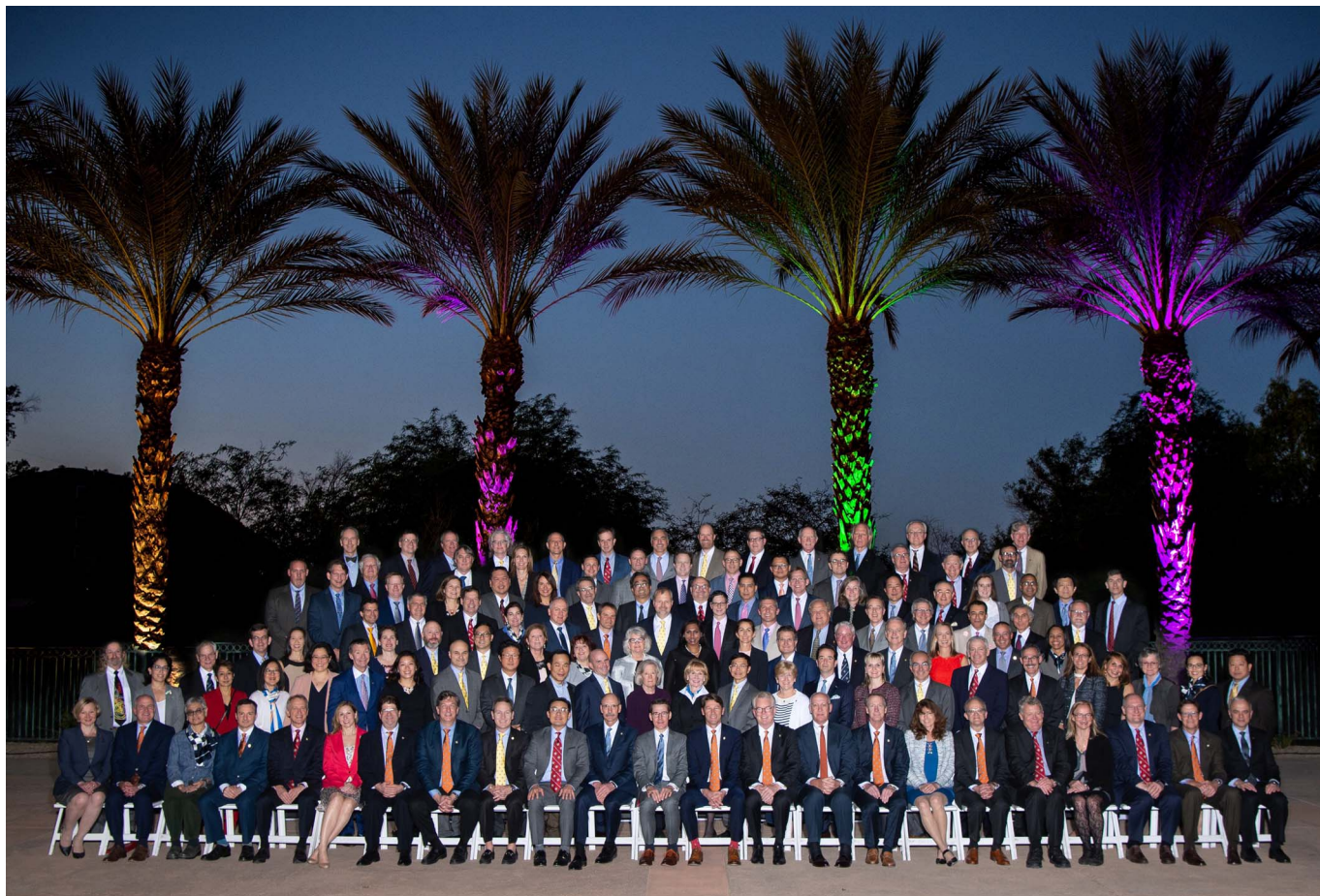
FIGURE 7. The American Board of Plastic Surgery 2018 Oral Examiners in Phoenix, Arizona.

dedicated to bringing gold standard healthcare to underserved parts of the world to improve access to comprehensive surgical care in the underserved communities and support sustainable health care through education, partnerships, and telemedicine. As you know, in many low-income communities, up to 90% of the population lacks access to safe specialty medical care. ConnectMed believes that every child and young adult deserves the chance to live a normal and productive life, instead of the social isolation and exclusion from school or jobs that many with congenital or acquired abnormalities face.