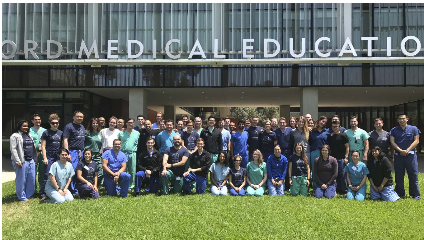
FIGURE 6. The 2nd Annual ACAPS West Coast Boot Camp held at UCSD.