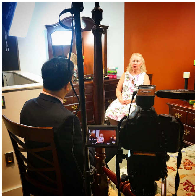
FIGURE 12. Shooting BRA Day video of UC Davis breast reconstruction patient.