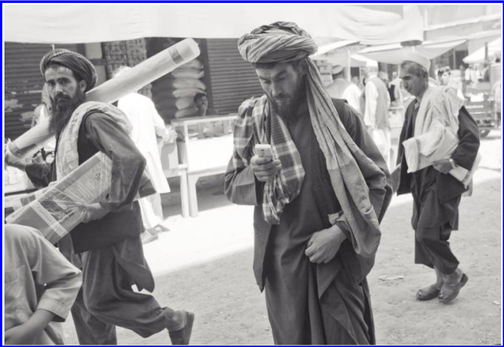
Street scene, Mazar-i-Sharif