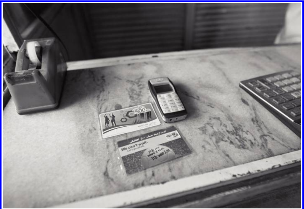
M-Paisa top-up cards with mobile phone, Kabul