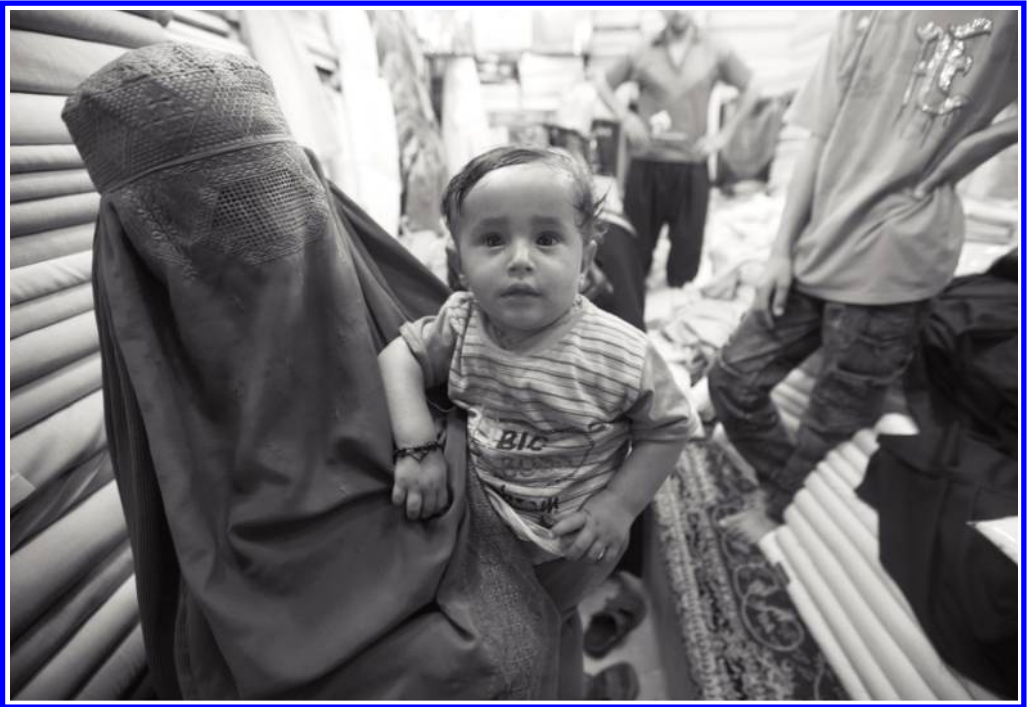
Mother with child, Kabul