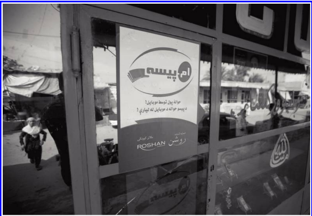
Roshan sign, Jalalabad