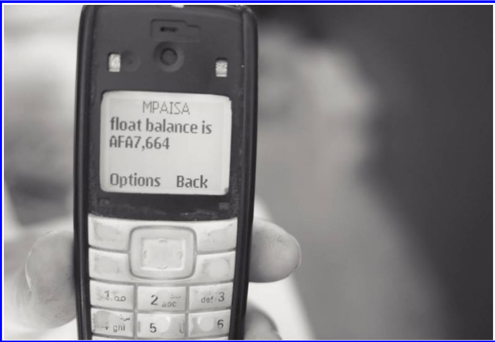
M-Paisa screenshot, Mazar-i-Sharif