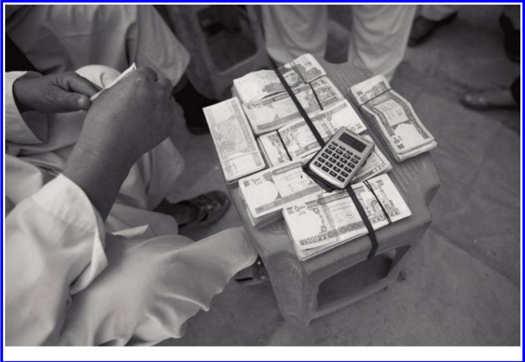
Street scene, Kabul