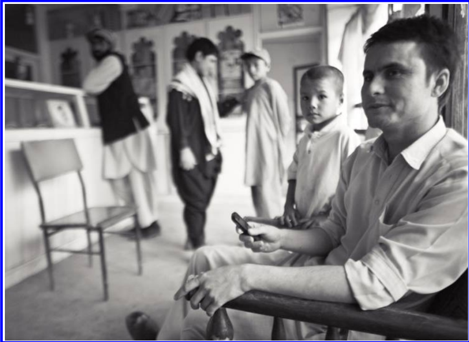
M-Paisa agent, Mazar-i-Sharif