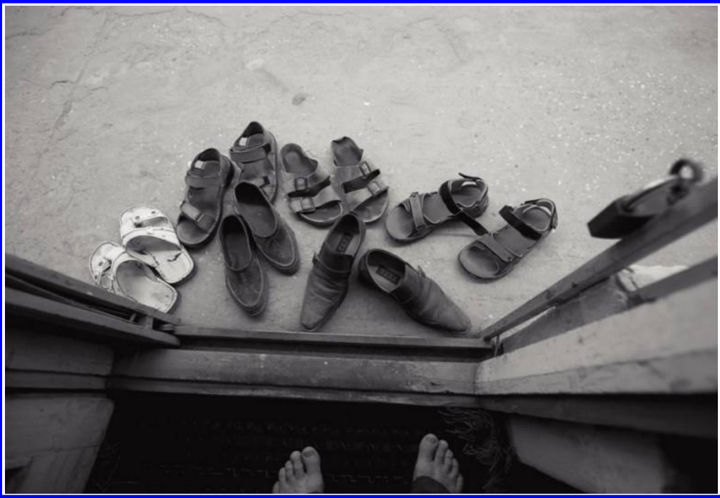
Entry to offices of Hawala agent, Mazar-i-Sharif