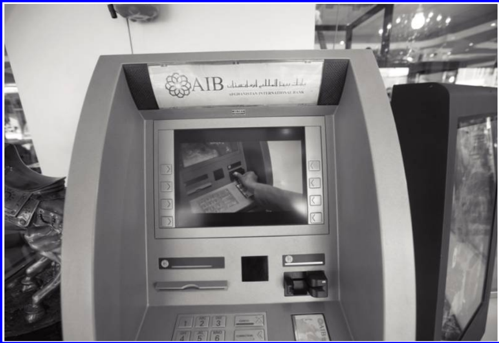
In-store ATM, Kabul