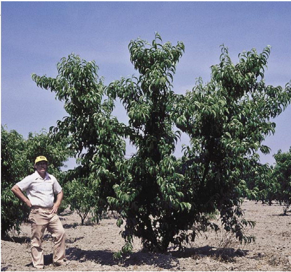
California's tree fruit industry developed shortly after the Gold Rush of the mid-nineteenth century. For many years the state's dominant orchard system was the open vase, with trees trained into a wide "V" shape and ample spacing, allowing for 70 to 90 trees per acre. Above, long-time UC technician Jim Doyle stood next to a standard peach tree in the late 1970s.

stocks to fit a range of orchard needs such as variety, season of ripening, soil type and pH.