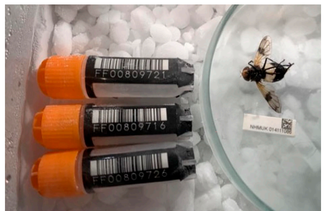
Fig. 1. An example of the documentation that should occur as a sample is being processed. The SPECIMEN_ID (the Natural History Museum, London [NHMUK] barcode under the fly) is photographed alongside the specimen and the barcoded tubes into which different samples of that specimen will be placed. The metadata tracking sheet would have three entries for this fly, where collection-related information would be identical, but tissue type and tissue size would vary (e.g., head, thorax, and abdomen, each in a separate tube).

Quantitative assembly standards. Where sufficient DNA and material is available from a single individual (or clonal colony), currently more than around 100 ng DNA per gigabase genome, we propose a minimum reference standard of 6.C.Q40 (i.e., >1 Mb NG50 contig continuity and chromosomal scale NG50 scaffolding, with less than 1/10,000 nucleotide error rate (see SI Appendix, Table S1 , taken from ref. 10, for notation and further information). When the chromosome NG50 is smaller than a megabase this will be C.C.Q40, with “C” denoting having achieved full chromosome lengths. This standard is now