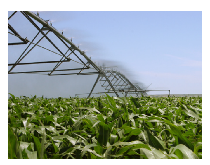
Figure 14. Overhead low-pressure irrigation system used for no-till corn production field, Pierre, South Dakota, 2005.