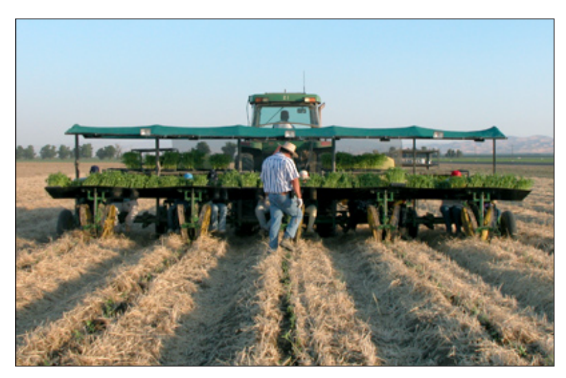
Figure 9. Transplanting fresh-market tomatoes in conservation tillage field, Sun Pacific Farms, Firebaugh, California, 2003.