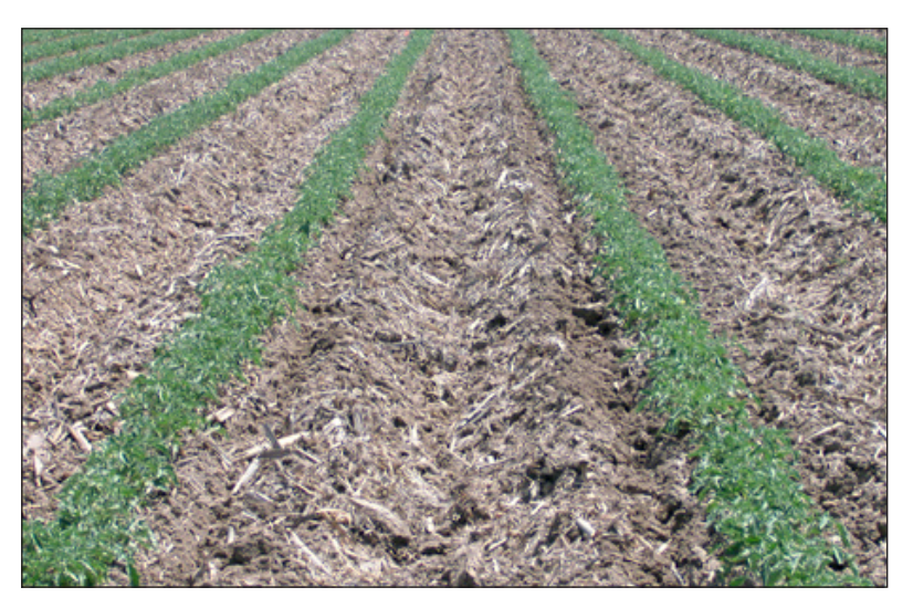
Figure 7. Cultivated processing tomatoes in Davis, California, conservation tillage study, 2004.

cleaning mechanism before the product entered tomato transport trailers.