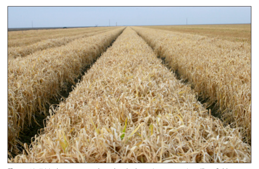
Figure 10. Triticale cover crop planted on bed tops in conservation tillage field, Sano Farms, Firebaugh, California, 2005.