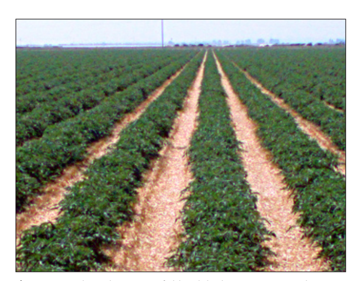
Figure 15. Fresh-market tomato field with barley cover crop residue, Firebaugh, California, 2003.

An additional modification of today's standard production systems that may further facilitate CT alternatives would be the use of controlled traffic harvest trailers that track only in permanent furrows and not on bed tops. By restricting heavy loads to the furrows, optimal crop growth zones might be preserved across the beds due to less compaction. Also, ideal cover crops should be developed for CT systems that are inexpensive, fast to establish so that weeds are suppressed, and easily destroyed mechanically or with herbicides as needed before transplanting.