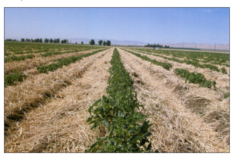
Figure 13. Strip-tilled transplanted fresh market tomatoes in barley cover crops, Sun Pacific Farms, Firebaugh, California, 2003.