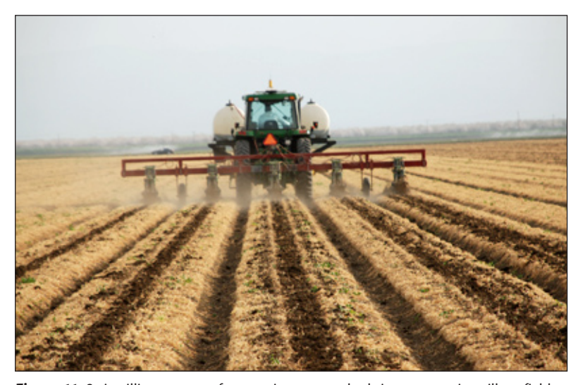
Figure 11. Strip-tilling centers of processing tomato beds in conservation tillage field, Sano Farms, Firebaugh, California, 2008.

However, in the 2003 trial, CT yielded 12 tons per acre more than ST. Using a crop value of $54.40 per ton, the gross return was higher by $756 per acre with CT. Custom harvest is charged on a per ton basis; therefore, the higher yield in 2003 for CT resulted in an additional harvest cost of $126 per acre. The increase in revenue per acre offset by the increase in harvest cost meant an increase in net returns over harvest cost of $630 per acre. Adding the savings in cultural costs and overhead costs ($106) to the increase in revenue adjusted for the increase in harvest cost ($630) gives a bottom line of an increase in profit of $736 per acre for CT.