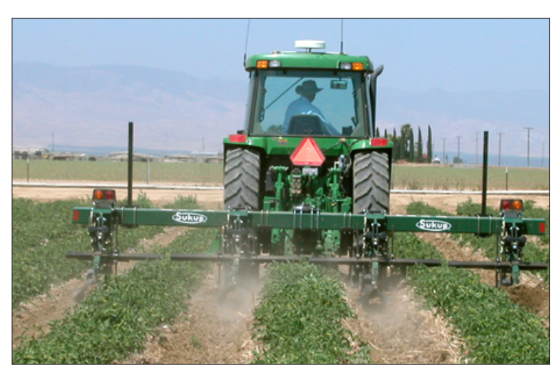
Figure 4. Cultivating no-till transplanted processing tomatoes in Five Points, California, conservation tillage (high residue) study, 2004.