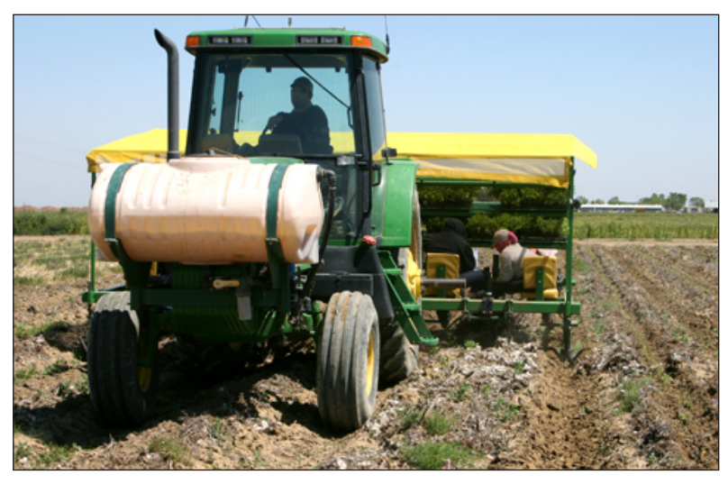
Figure 6. Transplanting tomatoes into "unworked" cotton beds from previous season in Five Points, California, conservation tillage study, 2005.

Note: Letters following each yield number indicate whether there were statistically significant differences between treatments within a given year; different letters in a particular column indicates that the systems likely had significant differences in yield.