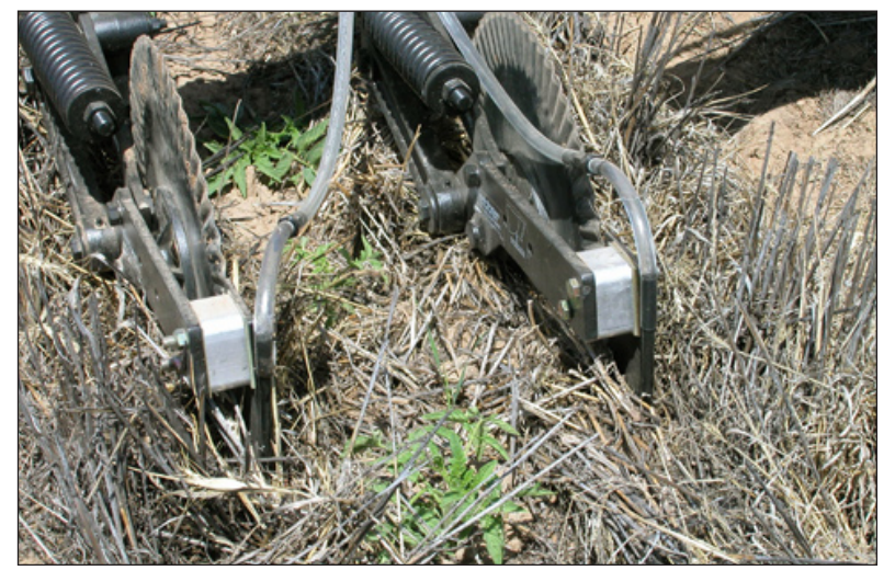
Figure 5. Applying liquid fertilizer as a side-dress to fresh market tomatoes in Parlier, California, conservation tillage study, 2002.

management operation, so they were reworked using furrow sweeps at transplanting and during in-season cultivations (see fig. 1). In the CT cover crop systems, the cover crop was sprayed with glyphosate, chopped, and left on the soil surface as a mulch before transplanting tomatoes or planting cotton (see fig. 2). A summary of pretomato tillage operations used in each system is shown in table 2.