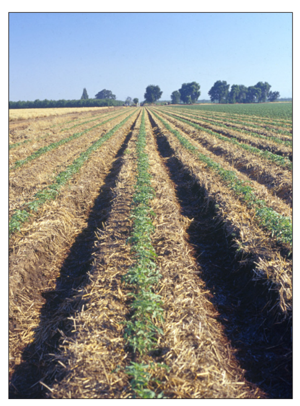
Figure 2. Strip-till transplanted fresh market tomatoes in wheat cover crop, Le Grand, California, 2001.

Minimum-till systems for tomatoes that rely on reduced-pass bed preparation and that disturb a far greater soil volume than is done in CT are discussed in a companion publication in this series, Minimum Tillage Vegetable Crop Production in California (Mitchell et al. 2004).