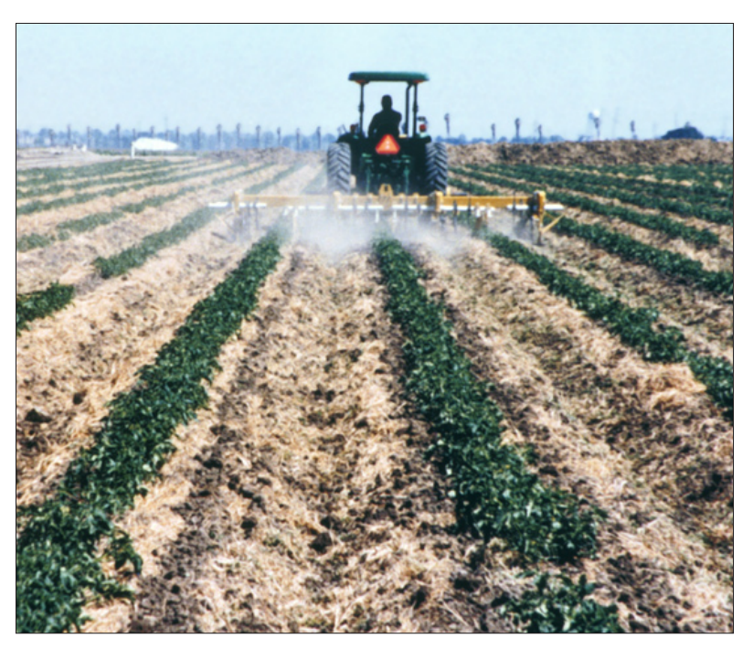
Figure 3. High-residue cultivation of strip-till transplanted processing tomatoes, Tracy, California, 1999.