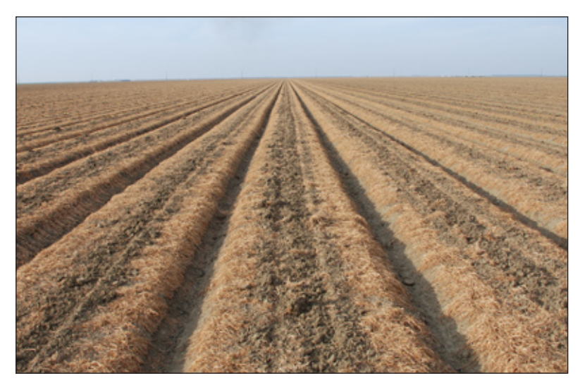
Figure 12. Strip-tilled triticale cover crop beds, Sano Farms, Firebaugh, California, 2008.