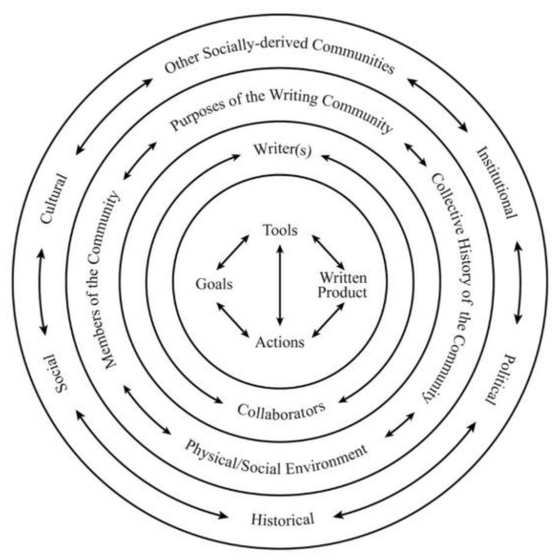
Appendix A Writing Community Components of the Writer(s)-within-Community Model of Writing

Note. Reprinted from Graham's (2018) A Revised Writer(s)-Within-Community Model of Writing