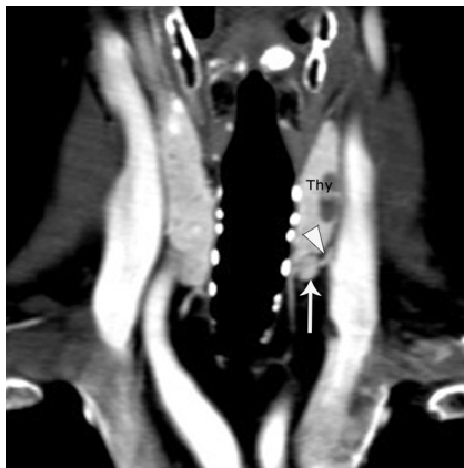
FIG 2. A 71-year-old woman with a left parathyroid adenoma. Coronal arterial phase image demonstrates a round hyperenhancing adenoma inferior to the lower pole of the left thyroid gland (straight arrow). A characteristic feeding artery (arrowhead) is seen at the superolateral aspect of the adenoma.

adenomas that could be identified on 4D CT in retrospect. Twenty-four of 32 (75%) parathyroid adenomas were reported prospectively in the radiology report. These cases represented the initial 4D CT scans at both institutions after introducing the protocol, and accuracy of localization was likely improved with experience. Four of 28 (14%) patients had double adenomas, and 2 of 28 (7%) had adenomas in ectopic locations (retropharynx and carotid space). The 32 adenomas in 28 patients had a mean weight of 0.66 \pm 0.65 g, a mean maximal CT diameter of 11.1 \pm 4.9 mm, and a mean arterial attenuation of 148 \pm 47 HU.