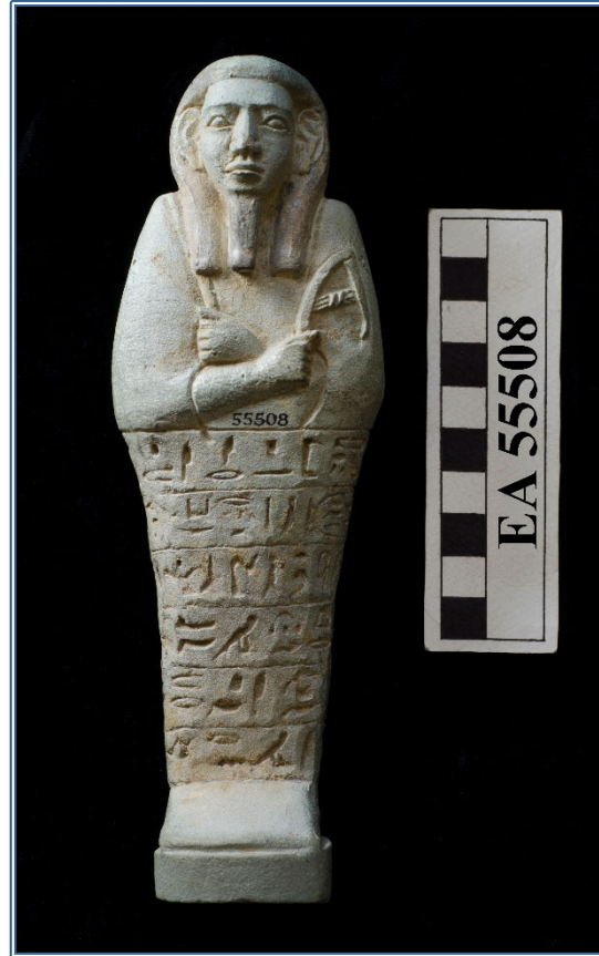
Figure 9. Shabti of King Senkamanisken bearing only a single hoe from Nuri pyramid 3.

title nswt bjtj as an empty boast or vain ambition to regain their ancestors' status as "King of Upper and Lower Egypt"—a land from which they had long since become alienated (e.g., Arkell 1961: 138; Adams 1977: 249-254; Redford 2004: 145). However, Kushite princes and princesses continued to occupy high priestly offices in Upper Egypt even after their royal kinsmen had surrendered Lower Egypt (Camino 1964; Parker 1962: 5 fig. 2c, 29 §50, pls. 1, 15), and indeed the appointment of some Egyptian priests was conducted under the imprimatur of the Kushite king Tanutamani years after his expulsion from the country (Vittmann 2001). So loss of territory should not be equated with the immediate loss of influence or commerce. Kathryn Howley's thorough analysis of the shabti figurines buried during the Napatan period at Nuri has noted several features