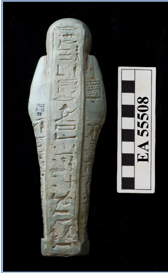
Figure 8. Dorsal pillar of King Senkamanisken's shabti from Nuri pyramid 3.