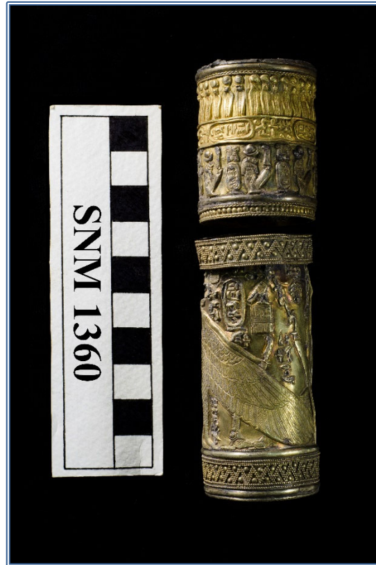
Figure 10. Funerary cylinder sheath of King Amanastabarqo.

inscriptions either ceased or diminished to so few examples that none has survived (figs. 2 and 3) between the reigns of Aspelta and Amannoterike (sometimes read as "Irike-Amannote": see Eltze 2018: 40). External sources (fig. 4) claim that a series of dramatic conflicts transpired between Nubia and Egypt during this interval—e.g., the defection of Apries' soldiers to Nubia (Schäfer 1904), an Egyptian caravan to Nubia in 529 BCE (Erichsen 1941: 57; Zauzich 1992;), the (likely apocryphal) aggression of a Kushite king "Aktisanes" against the Egyptian pharaoh Amasis (Eide et al. 1996: 515-520), and the dubious invasion of "Aithiopia" attributed to Cambyses II (Eide et al. 1994: 323-330; Török 2014: 32-37, 107-11 )—but internal sources from Nubia itself make no mention of any of these events (Török 2014: 110). It remains unclear whether non-political factors played any significant role in this prolonged Kushite silence, for a plague in "Aithiopia" (presumably