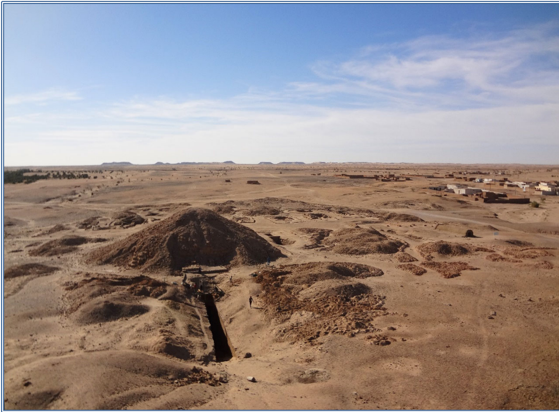
Figure 12. Kite photograph of el-Kurru showing largest pyramid (Ku. 1) in the foreground.

Macadam 1949: pls. 32-34; Eide et al. 1996: 522-532). According to one interpretation (Priese 1977: 355), the international fame of the Late Napatan king Gatisen in the fourth century BCE then led the Hellenistic author Hecataeus of Abdera to retroject him (under the moniker “Aktisanes”) into an account of much earlier and possibly apocryphal events of the Early Napatan era, an error later perpetuated by Diodorus Siculus (fig. 4; Eide et al. 1996: 515-520). Perhaps owing to this chronological morass, some have even termed the kings buried at Barkal as “Early Meroitic,” thereby associating them less with the Napatan period than with the epoch that followed it (Priese 1977; Pope 2014a: 42-45).