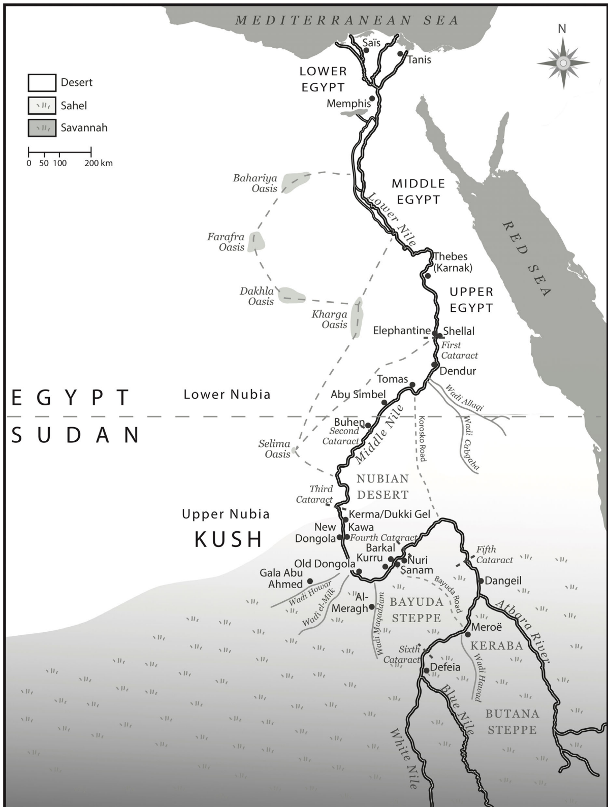
Figure 1. Map of northeast Africa during the first millennium BCE, overlaid with approximate modern boundaries.