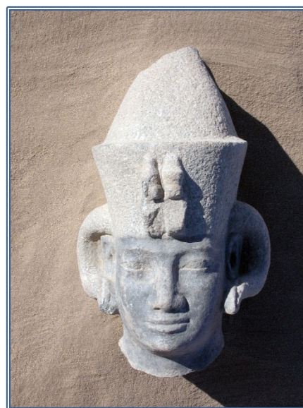
Figure 7. Broken head from a statue of King Anlamani at Dukki Gel.