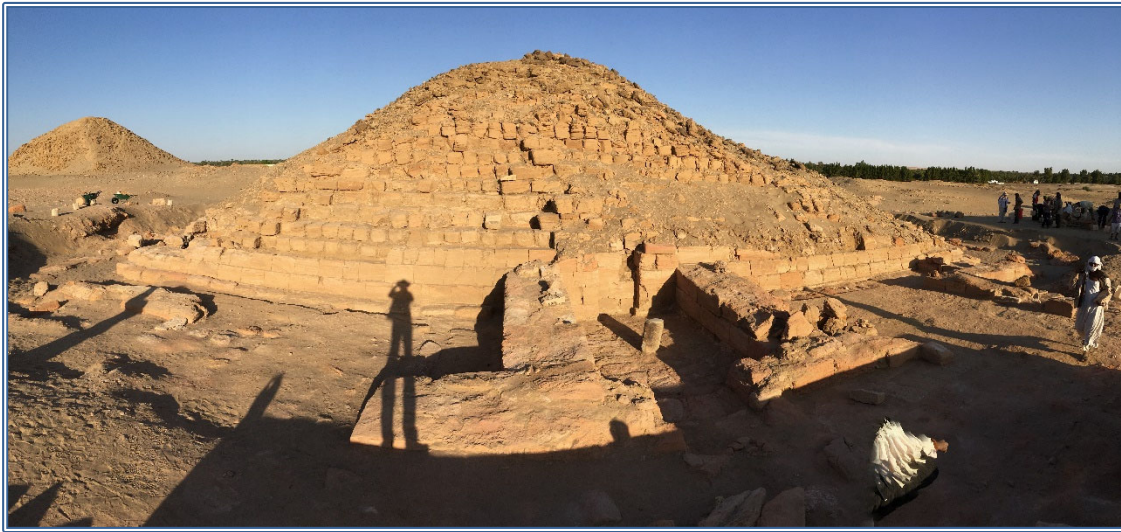
Figure 11. Pyramid of King Nastasen at Nuri (Nu. 15).

the resulting itinerary differs even more fundamentally from that recorded during the 25 th Dynasty, suggesting a creative evolution of Kushite political tradition (Pope 2014a: 41-58). Some Napatan royal inscriptions (ADS, DGS, and KHA in fig. 3; Schäfer 1895; M. B. Reisner 1934; Valbelle 2012) also list the names and offices of the kingdom's leading administrators (Pope 2014a: 146-147 Table A), but these have thus far resisted correlation with individual provinces of the Kushite state. Likewise, modern speculation about centralized ceramic production within the ancient Napatan state (Trigger 1978a: 226-227) has yet to be sufficiently demonstrated through comparative analysis across multiple sites. As generous as the Napatan corpus may be with details of domestic governance, there is much work left to be done before the internal workings of the kingdom can be satisfactorily understood.