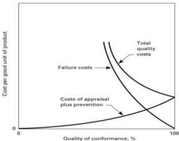
Fig. 1. Model for optimum quality costs juran [10, p. 822]

on failure costs [17]. Consequently, the companies should not withhold spending money for prevention and appraisal costs, in order to eliminate or reduce failure costs, because of much less costly to prevent a defect than to correct one. Juran's graph can show, how quality program can affect the quality costs (cost of poor quality) of the products or services. This graph is included two axes that are time on the horizontal axis and cost of poor quality on the vertical axis, Juran stated that quality cost or "non-quality" is the best parameter to evaluate quality improvement into the organization. As depict in Figure 1, the minimum level of total quality costs can be obtained, when the quality of conformance is 100 percent (perfection). In the reality, it is impossible to achieve perfection. It is justifiable that prevention and appraisal costs (control costs) increase slowly, while failure costs as well as total quality cost are reducing considerably during implementing quality management tool/s in the firms [9].