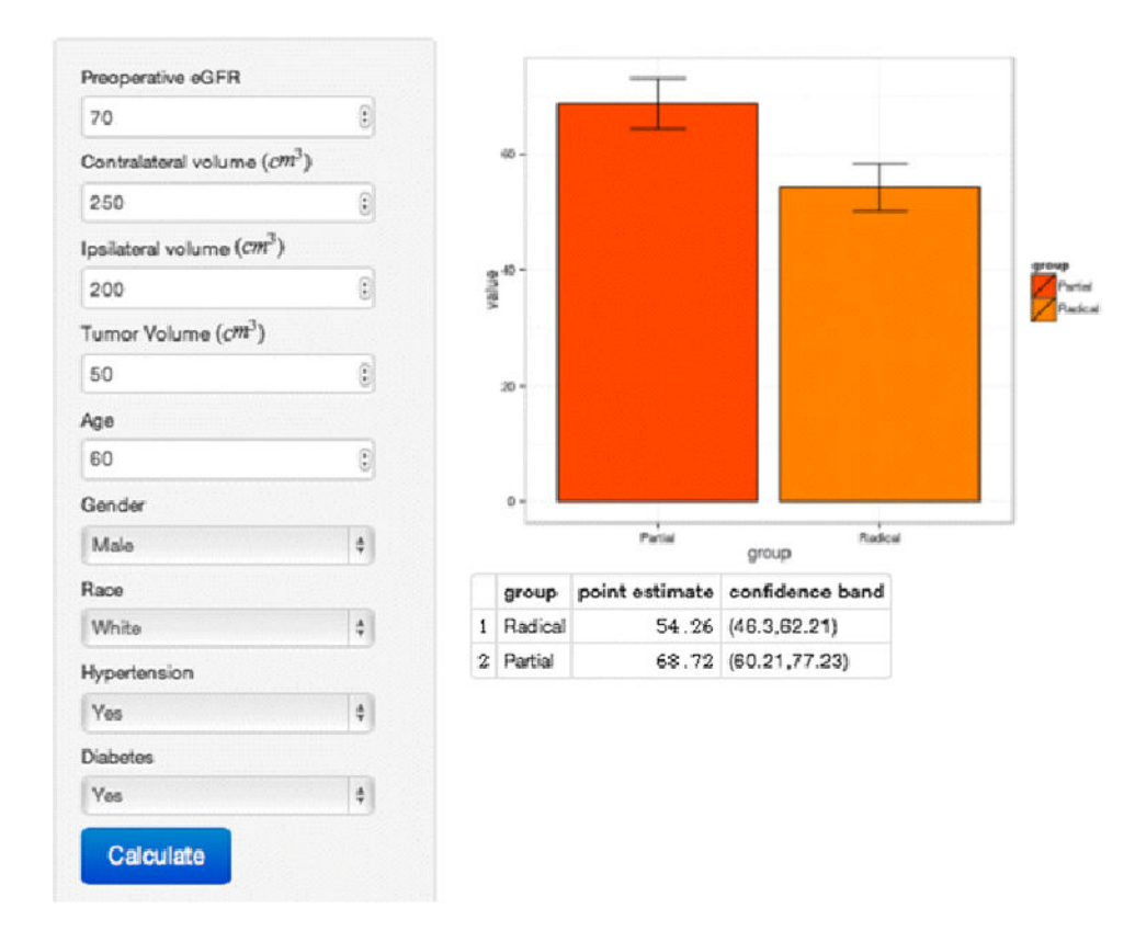
Figure 2. Predictive tool to determine renal function benefit of NSS compared to RN online calculator

The figure shows how the online calculator can be used in an office based setting. Once the radiologist provides the volumetric assessment of the kidney tumor, ipsilateral, and contralateral volumes, clinicians can put the numbers into the calculator along with GFR, age, gender, race/ethnicity, and extent of hypertension and diabetes. On the right side of the figure are two bar graphs. The red bar on the left is the predicted GFR if a partial nephrectomy were to be performed and the orange bar on the right indicates the predicted GFR if a radical nephrectomy were to be performed. The number values are indicated below the bar graph.