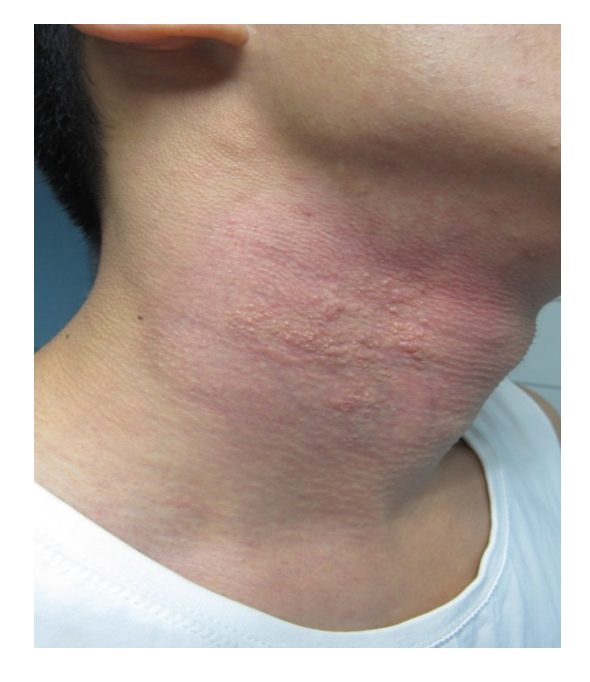
Figure 1. Sharply defined red patch with multiple papules on the neck, the papules with bright luster and hairless.

A biopsy was taken from a papule. Histopathological examination showed epidermal hyperkeratosis and acanthosis, perivascular inflammatory cell infiltration in the upper dermis, and proliferation of eccrine glands in the deep dermis (Figure 2). The structure of the eccrine glands appeared normal and some eccrine sweat glands showed dilated coils of normal appearance (Figure 3). Based on the clinical and histopathological findings, eccrine nevus was diagnosed and no treatments were given.