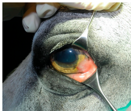
Figure 3. Clinical photograph of a Connemara Pony (Case 3) depicting the pink, raised mass on the left temporal limbus and cornea.

A seventeen-year-old Connemara Pony gelding was presented to the Bailly Vétérinaires Clinique du Lys for evaluation of a mass affecting the left eye. Ophthalmic examination revealed a pink, raised mass affecting the temporal limbus and cornea OS (Figure 3). The mass was excised completely and sent for histopathological examination. Histopathology found the mass to be composed of atypical keratinized epithelial cells that were not uniform (differed in shape from round to polygonal), and were arranged in clusters or individually. Criteria for malignancy were considered to be obvious and included a high nucleocytoplasmic ratio, large nuclei with granular chromatin, prominent and visible nucleoli, moderate anisocytosis, and anisokaryosis. The pathologist's conclusion was epithelial carcinoma (SCC).