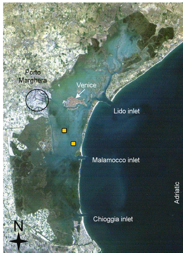
Fig. 3. Satellite view of the Venice lagoon with indication of the three inlets connecting the lagoon to the Adriatic sea. Porto Marghera is the industrial center with important petro-chemical facilities. Squares are where the SIOSED project is being developed.

Using a grab, the sediment was dredged 1 m deep and transplanted into the banks. The banks were contained by a wood-piling fence to protect against immediate erosion. The wood-piling area was also layered from the inside with fine mesh in order to retain and allow sedimentation of the smallest particles. The banks