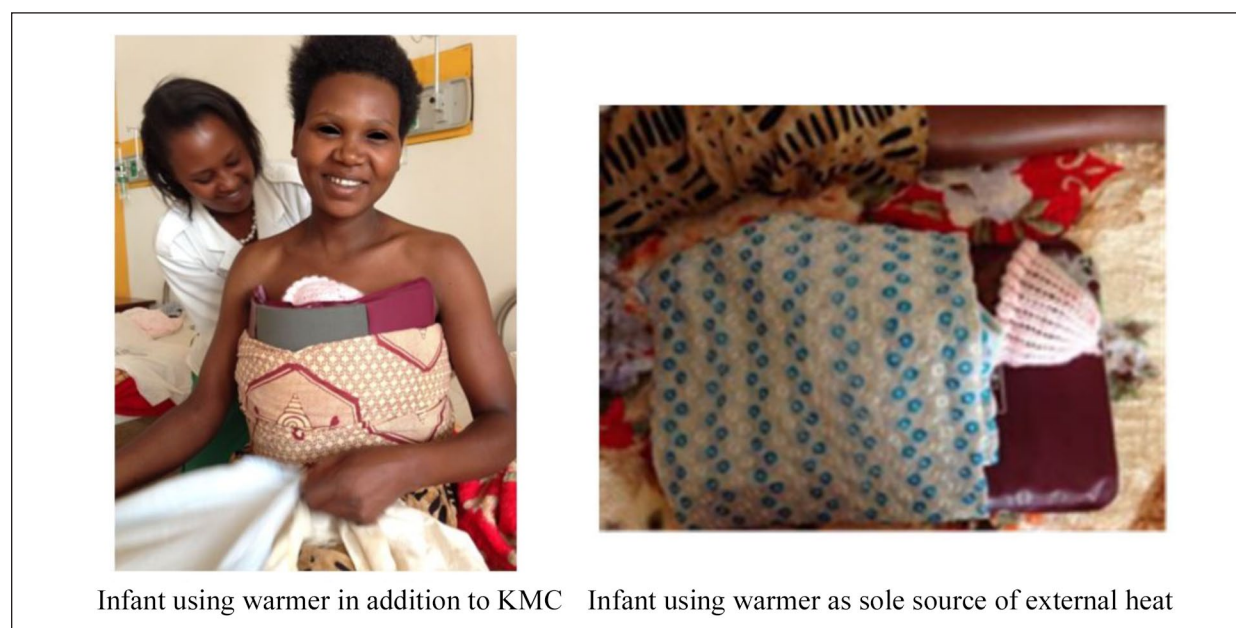
Figure 1. Infant warmer.

Abbreviation: KMC, kangaroo mother care.