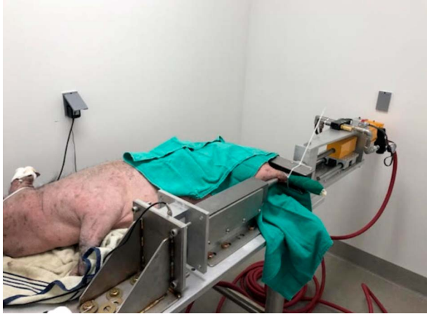
Figure 3. Porcine model used to create pilon fracture and demonstrate importance of articular reduction in porcine pilon model; decreased damage and PTOA when articular fragments are reconstructed. PTOA, posttraumatic arthritis.

therapies. Unfortunately, compared with their smaller animal models, they are more expensive, more difficult to house, have more genetic variation, are not typically genetically modifiable, assays/sequencing are challenging, and a veterinarian partner is typically required for studies.