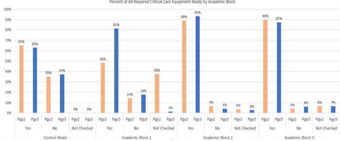
Figure 2. Percent of all required critical care equipment ready by academic block: displays the percent response of "Yes", "No", or "Not Checked" (survey default response) by academic block when responses are averaged across all survey items.