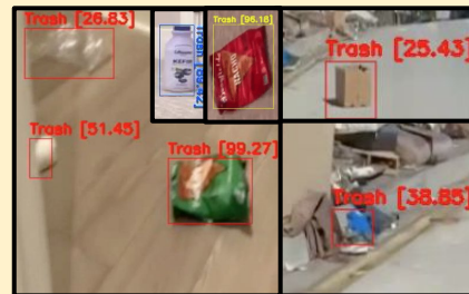
Fig. 4. Example outputs of trash detection for indoor and outdoor environments (borders represent distinct frames).