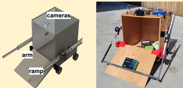
Fig. 2. CAD of WALTER (Left) and physical prototype of WALTER (Right). WALTER is assembled with 3D printed components.