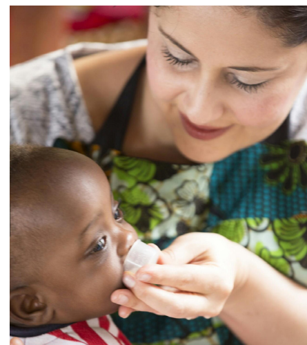
Sanyu Babies Home - Orphanage

As I reflected back on this experience and related it to my own life, I realized, in Uganda, I was just one person among desperate conditions. I felt helpless at times, knowing I was unable to really affect long term change. It saddened me to think after I was gone, the orphan and widow would continue to be without, the sick would continue to be uncared for, and the desperation would continue to grow. So what could I do? I chose to just make a difference for that one day. Show compassion and empathy in that moment. Lend a hand for that one project. Make a difference for the present even if it was just in one life. I realized that this should be my goal everyday. I brought Africa home with me as I share my life with others. As a nurse, I will continually strive to look past the patient's background, disease, economic, and social status to truly see the vulnerable person who needs me to invest in their care and to make a difference; even if only for one day.