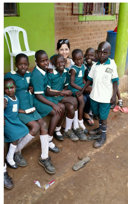
House of Praise Orphanage, feeding program