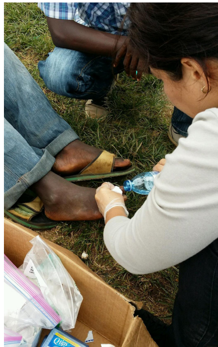
Caring for homeless children in the slums of Kampala

us but we would find ourselves in the middle of the floor trying to love on as many as our hands could comfort.