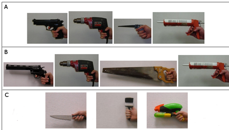
Figure 2. Stimuli. Panel A: In Study 1, participants rated the height and size of men holding a .45 caliber handgun, a drill, a small handsaw, and a caulking gun. Panel B: In Study 3, participants rated the height, size, and muscularity of men holding a .357 caliber handgun, a drill, a large handsaw, and a caulking gun. Panel C: In Study 5, participants rated the height, size, and muscularity of men holding a kitchen knife, a paintbrush, and a toy squirt gun. In Study 2, participants rated the potential lethality of the objects shown in Panels A and B. In Study 4, participants rated the potential lethality of the objects shown in Panel C, as well as identifying the age (adult vs. child) and gender of the persons most associated with using each object. Photographs, presented to participants in color, were resized so that the objective dimensions of each hand displayed on the participant’s computer screen remained constant across all images. doi:10.1371/journal.pone.0032751.g002

advertised in the U.S., and enjoying commercial success, at the time that these studies were conducted).