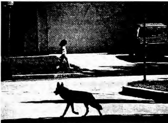
Figure 1. An urban coyote strolls through West Hills, a suburb of Los Angeles, California, in July 2002.

The typical activity pattern of coyotes in the absence of human harassment seems to be largely crepuscular and diurnal, but when predator control activities are undertaken, coyotes shift their activity mainly to nighttime to avoid humans (Kitchen et al. 2000). Conversely, a lack of human harassment coupled with a resource-rich environment that encourages coyotes to associate food with humans can result in coyotes losing their "normal" wariness of humans. Howell (1982:21) stated that this sort of environment, which had developed in hillside residential areas of Los Angeles County, produced "abnormal numbers of bold coyotes." At that time, he noted it was not unusual for joggers, newspaper delivery persons, and other early risers to observe 1 to 6 coyotes daily in such residential areas. By the late 1990s, Baker noted that coyotes in this area commonly could be observed feeding in late mornings and afternoons, and residents saw coyotes in yards, on streets (Figure 1), and on parks and golf courses throughout the day (Baker and Timm 1998). More recently, coyotes have been observed during mid-day on school grounds. Such behavioral changes appear to be directly associated with increased attacks on humans.