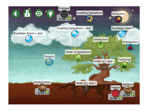
Figure 2: Content Tree Map for From Here to There!

Points are used to help a user maintain extrinsic motivation and track their progress (von Ahn, 2013). Participants receive up to 3 points per problem for