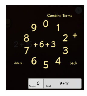
Figure 1: Circular calculator to replace expressions.

equation manipulation interface, the tasks or 'goals' of the user, and the broader application context<sup>1</sup>. For each iteration, we initially evaluated the system with small groups of students. Only the most promising programs were evaluated in classrooms. The experiments reported here reflect a current state, rather than a conclusion, in this process.