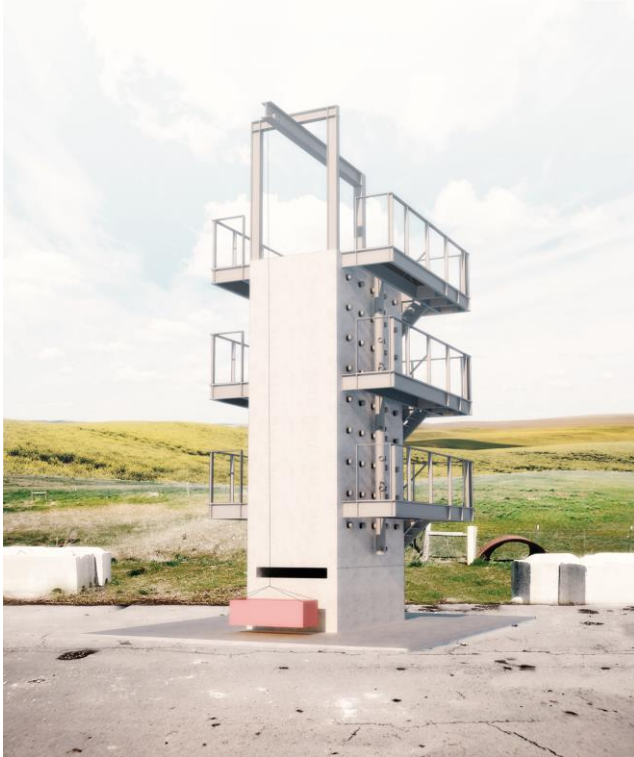
Figure 9: One of the original concept images for the “Urban Death Project,” which would eventually evolve into contemporary natural organic reduction technology. The multi-story compost vessel would allow for deceased bodies to be laid-in on each level.

someone back the soil that is created from just their person would be purely symbolic. If what we're trying to do is reconnect with the fact that we're all part of this grand natural world, let's say, ok, we really are part of this system that's greater than ourselves." 135