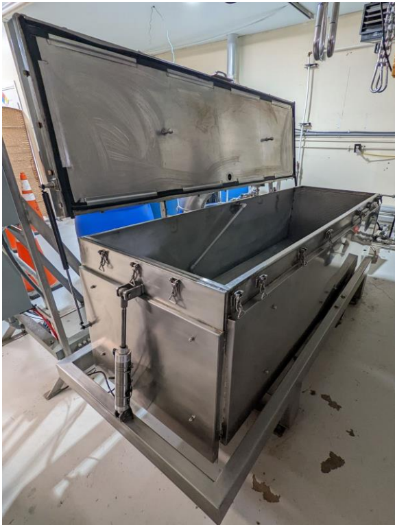
Fig. 2: An example of an alkaline hydrolysis chamber, personal photo 2022

first single body human alkaline hydrolysis system, the adoption of which was likely influenced by the scientific claims that the process could safely eliminate prion diseases (brain diseases that can be contagious and are always fatal) and other pathogens that may be present in donated cadavers. Because legislators and proponents framed alkaline hydrolysis as a means of safely disposing of donated remains, there was less discussion about its ethical merits. The donated remains are depersonalized, and often family members do not request remains back after donation, although this is possible in some cases. In this way, early alkaline hydrolysis was permitted because it was disconnected from the disposition process as personal or ritual and instead was largely perfunctory. Alkaline hydrolysis has gained momentum since 2010 and is currently approved in 24 states. However, at least nine of those twenty-four do not have any active practitioners, suggesting that there is a significant gap between tacit approval and practical embrace of alkaline hydrolysis.