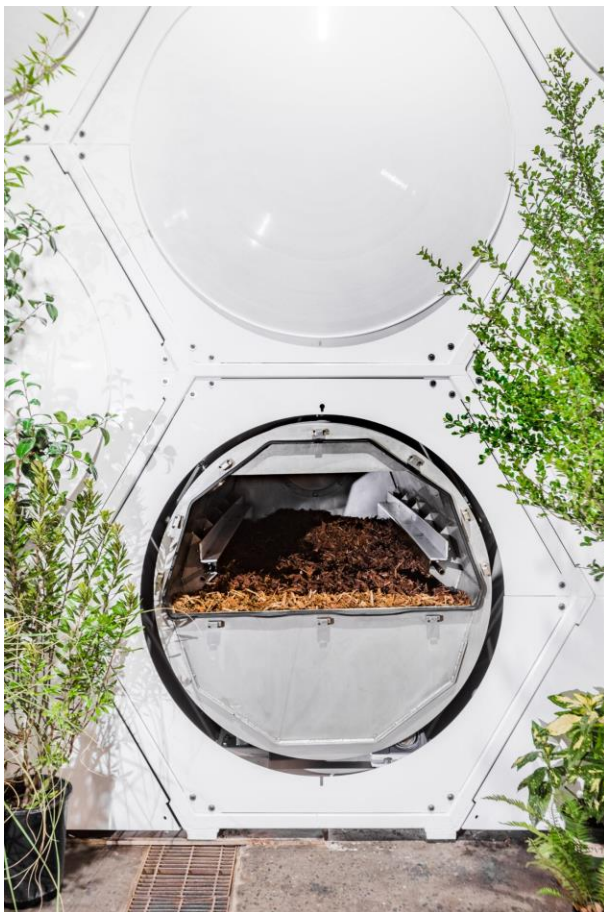
Figure 8: The “honeycomb structure” observed in a natural organic reduction facility.

larva stored in a wax cell, to be harvested later. There is a degree of tension between the operators of the cultivated urban aesthetics of the metal vessels and the more rustic designs of the large, wooden cradles. The original designs for urban natural organic reduction aimed to distance the process from a family compost heap, creating the image that the process, and even the deceased person themselves, is clean, beautiful, simple, and, ultimately, not a smelly compost heap. The cradle designs, some of which are outside, and all are manually rolled, break down some of this illusion. Without technological monitoring, some providers feel like the manual cradles are more at risk of “failing” and compromising the specialness of the process for a human body. Not to mention the potential legal ramifications for improper operation.