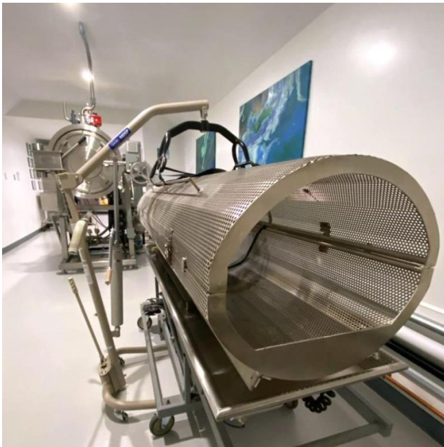
Figure 2: An example of an alkaline hydrolysis internal chamber. The body is placed inside, and then this is placed into the larger chamber seen in the top left of the image. Publicly available image, 2021.

System developers claim that the process destroys all RNA, DNA, and pathogens and breaks down embalming fluids, cytotoxic agents, and biological and chemical agents into harmless materials. The resulting material contains amino acids, peptides, sugars, and soap that can be disposed of through municipal sewer systems if certain water regulations are followed. The brittle bone material retained in the chamber is dried and crushed and may be returned to the decedent's family. 16