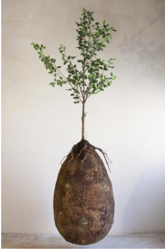
Figure 2: The “Capsula Mundi” tree pod. An artistic rendering of a disposition method, in which the deceased is meant to be enclosed into the large, oval pod at the base of the tree.