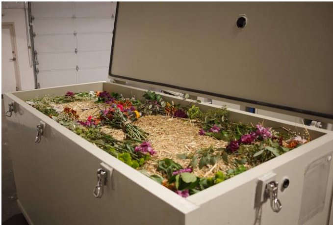
Figure 3: An example of a vessel used in natural organic reduction.

efforts to pass Senate Bill 5001, which made Washington State the first place in the world to legally approve natural organic reduction, defined as “the contained, accelerated conversion of human remains to soil.” 17 The process places a high-nitrogen mulch product into a metal or wooden vessel, atop which the deceased is placed. The mulch interacts with the carbon in the body and the combined chemical process, heat, and gentle movement of the vessel aids in the process of decomposition. The result is a compost-like product that family members can use in gardens or the remains of which can be placed in conservation areas.