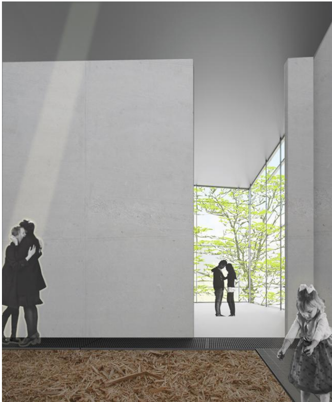
Figure 10: A mock-up from the Urban Death Project, demonstrating how people might gather at the top of the silo to lay their person into the compost (from the Urban Death Project).

unwilling to cede that individuality in death. 138 Moreover, religious bodies, such as the leadership of the Catholic Church, have specified that remains need to be kept together and buried (although only permitted in the case of cremation so far). So, the theoretical model of the silo did not realistically engage with ways in which people think about the deceased body. Conversely, the individual vessel model both represents and reproduces our social norms as well as results from an interaction between the designers, legal boundaries, and the people requiring these services. 139