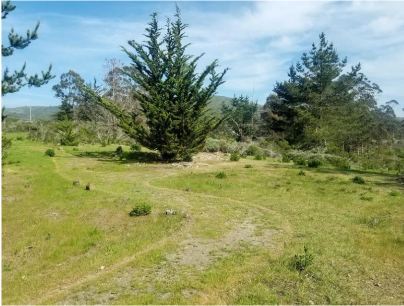
Figure 2: A walking trail in a green burial ground, grave sites only lightly visible (under the central tree and in the bottom right corner of the photo).