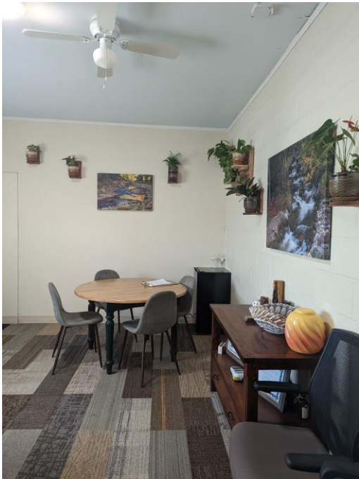
Figure 3: A room in the front-of-house for an alkaline hydrolysis facility, replete with plants, nature prints, and sculptures.

much larger space where that might be possible. At present, he has a little sitting room to host visitors, and the most obvious feature is the considerable number of plants that are placed on tiny shelves across the wall and on every available flat surface. I learned that the donated alkaline hydrolysis “tea” that results from the process is used to fertilize the plants, which appeared remarkably healthy considering the winter climate. Each plant is a small reminder of the benefits of processed remains.