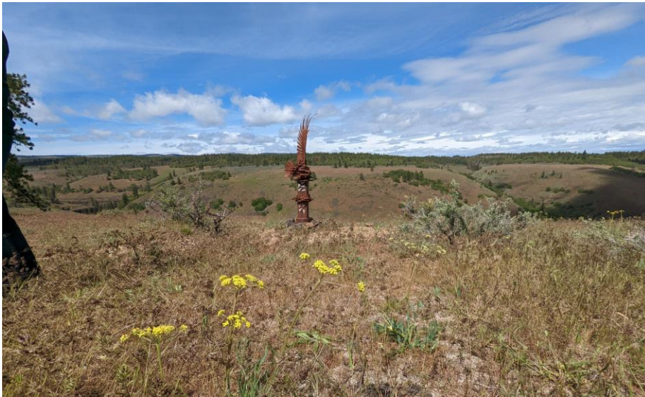
Figure 1: An example of the area surrounding a conservation burial ground. Centered is a rusted metal sculpture that represents the burial ground, per the provider.

benefitted from Lindsay and Chris’s example and advice. Sarah Jane is much younger than the progenitors of the movement, but her enthusiasm about the practice was just as palpable as Lindsay’s. As we walked through the winding trails, Sarah Jane, clearing stray branches from the path by habit, pointed out that because they are “land rich,” her phrase, they should use that land for burial, as opposed to turning to practices like cremation, or natural organic reduction. And indeed, the grounds that I visited on both sides of the country were well off the beaten track.