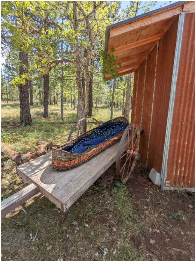
Figure 6: An example of a hand cart used to transport the deceased body to the grave on green burial grounds (personal photo, 2022).

person, in a coffin or wrapped in their burial shroud, into the burial area. Manually operated carts like this, some influenced by Amish designs, were present at several of the burial grounds. The family is encouraged to physically transport the deceased to their final resting place. This final act of service connects the family to the burial process itself, demonstrating that this type of ritual is not only symbolic, and actually involves the physical participation of the participants.