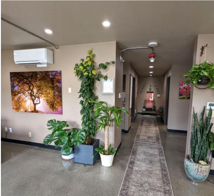
Figure 4: An entryway into a natural organic reduction facility, with plants, nature prints, and warm touches of carpet (personal photo, 2022).

soften the otherwise industrial environment but are also conscious reminders of the result of the natural organic reduction process. Ultimately, your remains will return to the earth, but these additions also implicitly signal that you can become a plant or a tree. I will discuss this particular desire in the next chapter, but here will address how the physical space allows visitors to project this desire onto it.