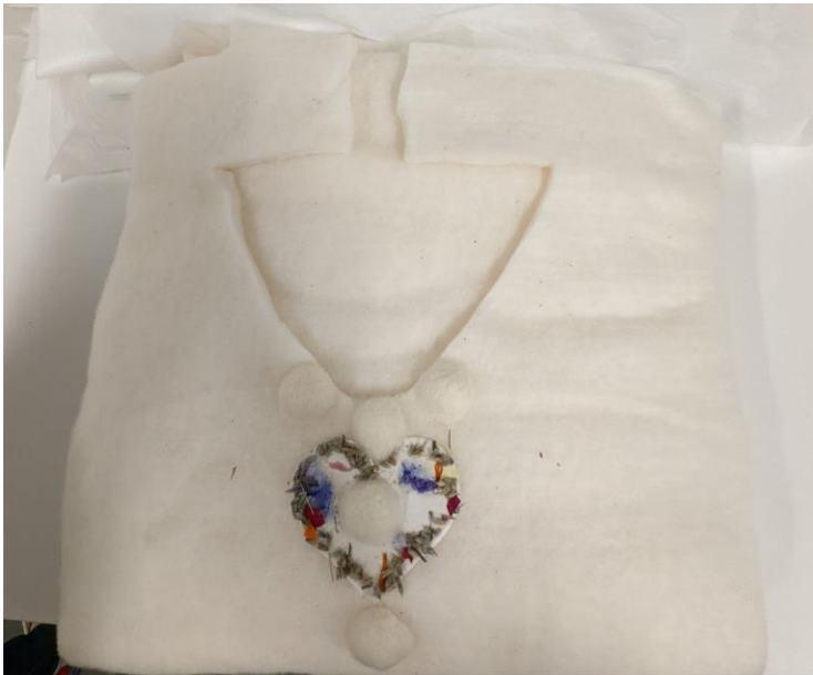
Figure 3: Cotton burial shroud for natural organic reduction, personal photo taken at Return Home, 2022

to several hundred dollars. 108 Dawn joked with me, as we sat outside her refurbished mill-turned-funeral home, that the most environmentally friendly way to dispose of a person would be for them to die at home, be wrapped in their own bedsheet, and then buried in the yard, but few people take this route. A sensible compromise, albeit a more expensive one, is natural organic reduction in which the shroud, and the eventual return home, are possible.