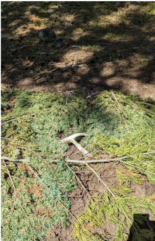
Figure 7: A green burial plot atop which a family has placed some deer antlers that they found nearby. This serves as an example of the kind of natural decoration and connection to the surrounding landscape and wildlife common in these burial grounds (personal photo, 2022).

The memorialization of the person once they have gone through their disposition process has also developed away from the conventional. Occasionally, conservation burial ground operators find that people want to mark their loved one's grave and the operators must educate the client about the importance of maintaining the environment as close to natural as possible. The operators remind clients that the reason they wanted their person buried there, or the reason the deceased chose it for themselves, is because of the natural beauty and resonance with the environment. To me, this signals that by introducing markers or other non-native species or objects, environmental purity is compromised. This is purity in the ecological sense, distinct from the purity that has marked the conventional cemetery, which is more visual and includes pesticide-maintained plants and mown lawns. 129