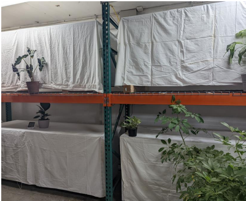
Figure 5: Individual plants sitting on top of natural organic reduction vessels.

Mick's outdoor natural organic reduction facility uses a similar cradle design, but is surrounded by wild, natural land, which directly suggested where people might distribute the processed remains. Mick's personality offered a sharp contrast to Timothy's steady gravity and to the attitudes of other urban natural organic reduction providers. Brusque, straightforward, and strong-willed, he was adamant that his approach, holistic and completely natural insofar as no external power sources were used, was best. As we approached the cradles, we could hear the birds calling and the early May flowers were starting to emerge. Even the rugged, farm-style cradle in which the body is placed evokes a raw and natural feel. Timothy and Mick's rustic natural organic reduction containers are notably distinct from the metal, industrial, and clean aesthetic of the urban natural organic reduction facilities. And this difference has caused some tension between environmental impact and acceptance of the practices, which I will address further in the next section.