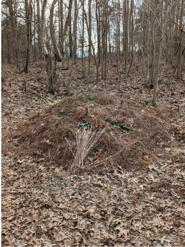
Figure 1: An example of a personally selected green burial site, chosen for its proximity to the trees, and a small pond in the distance. The mound is made up of the natural materials removed from the dug grave and added tributes of local flowers and stones that were found around the grave site (personal photo, 2022).

Green burial providers cultivate an appreciation and even love for a specific environment. And this love for place begins with the providers themselves. In my phone conversation with Isobel and Luke, they continuously emphasized the native species, preserving the landscape and the original structures, and the natural beauty of their southern region. Business partners and long-time friends, Isobel and Luke would pause our conversation to say things like, “do you hear that blue jay, it is so close!” When I visited their burial ground nearly a year later with my brother in tow, they had the same enthusiasm for the natural species and space they had cultivated. Isobel, a cheerful woman in her late 50s, was attuned to the need to present and cultivate their land in a way that appealed both to the liberal conservationists from the closest city as well as to the neighboring farmers who take pride in working the land. This is why Isobel was eager to restore the old barns and shelters