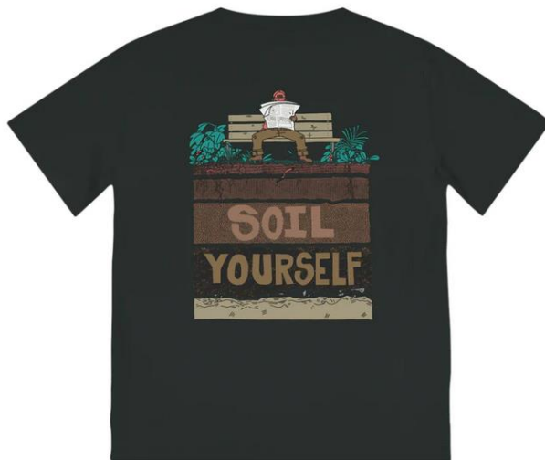
Figure 4: An example of natural organic reduction “merch,” with the phrase “soil yourself” written in the ground soil beneath a person reading a newspaper on a bench. Image used with permission from Return Home.

the irreverent images of skeletons in soil, with the tagline, “soil yourself.” Such promotions appeal to the ‘irreverent’ younger generations. This method connects the companies with these people early, with the aim of facilitating a sea change within the industry. Similarly, if I click over to the merch shop for another natural organic reduction facility, I can find “When I die, please compost me,” shirts and merch. This approach contrasts with that of a conservation burial ground across the country, which instead of focusing on merchandise, has instead funded a library and community center. These sites provide free resources like books and courses on coping with grief and loss and end-of-life planning. Creating a shared community and educational space, although also separate from their function as a funeral home, appeals to a more conservative set and is a more approachable way for older people to learn about the eco-disposition options.