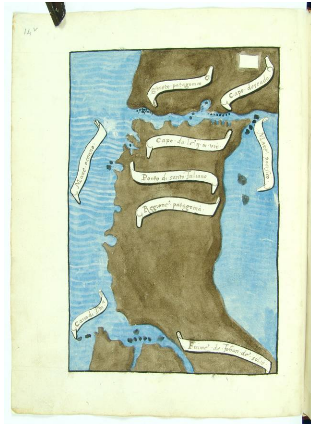
Figure 6. Pigafetta's chart of the Strait of Patagonia. Ambrosiana Library, L 103 Sup. Courtesy of the Ambrosiana Library. Milan, Italy.

To trace the development and global extension of the isolario genre is, from an epistemological perspective, to witness in terms of the history of cartography a capital example of what Casey has described as “the remarkable elasticity of scope of the employment of cartographic images.” 13 According to a historical itinerary that moves from the Mediterranean to the world, the book of islands departs from the Aegean at the very heart of Mediterranean culture and, by way of the Venetian lagoon, comes to encompass all of the “islands of the world” in Bordone’s printed isolario . In Pigafetta’s manuscript book, it captures in its capacious embrace the third of the three great “Mediterraneans” of the globe identified by Pierre Deffontaines (besides the one constituted by the Gulf of Mexico and the Caribbean), located between the southeast China Sea and the Indonesian and Philippine seas. 14