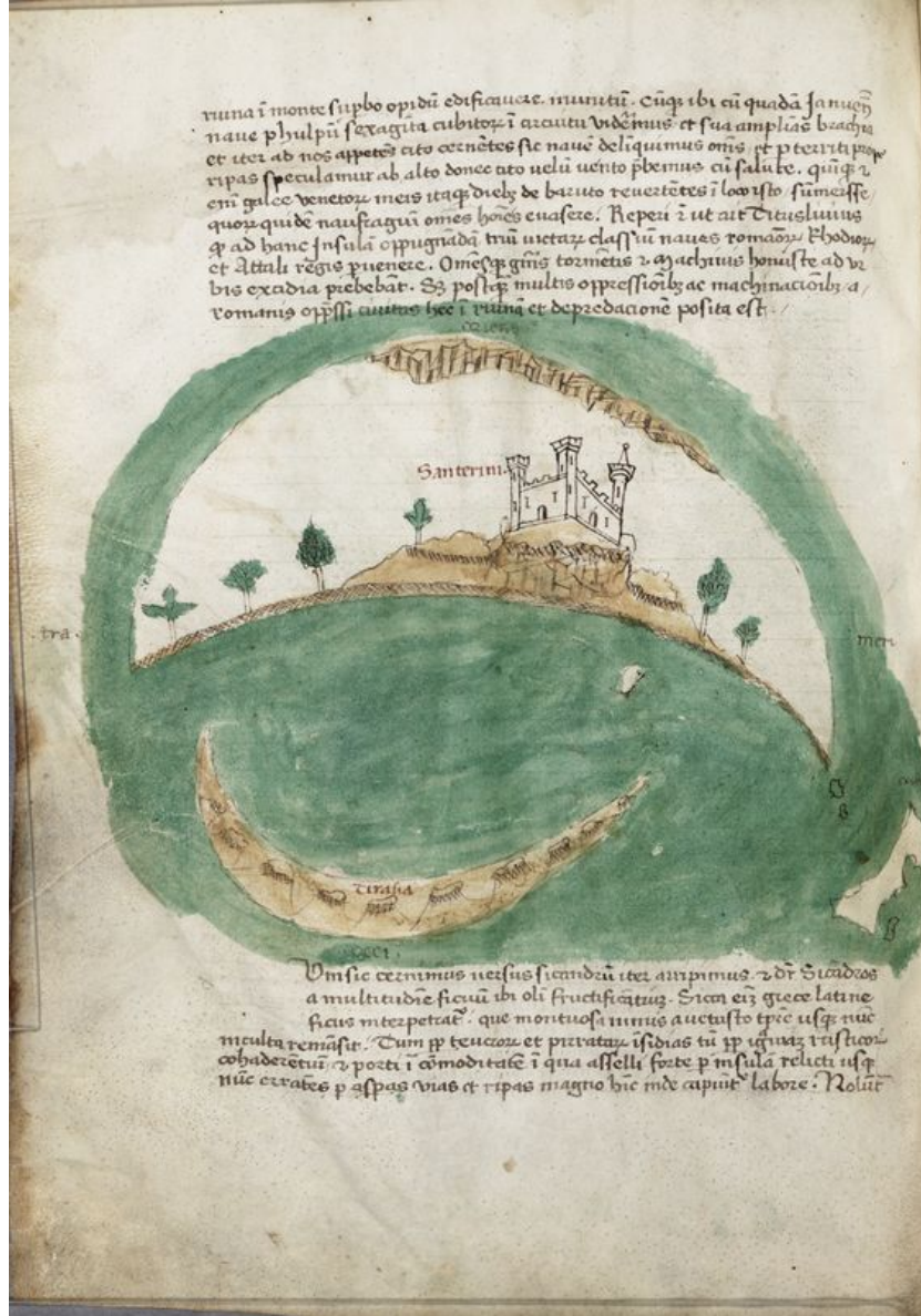
Figure 1. Santorini. Liber insularum archipelagi. Buondelmonti. P/13(11V) P/13(11v).

The first printed isolario also focused on the Aegean and derived much of its content and maps from Buondelmonti's Liber insularum archipelagi . It appeared around 1485 and was authored by a Venetian ship captain who adopted the pen name Bartolomeo da li Sonetti, in allusion to the sonnets that accompany the book's 48 woodcut maps. Bartolomeo da li Sonetti's "book of islands" was published about the same time that Henricus Martellus Germanus, a German Benedictine working in Florence, was introducing into his five manuscript recensions of Buondelmonti's Liber (sometime between 1480 and 1490; also known as the Insularium