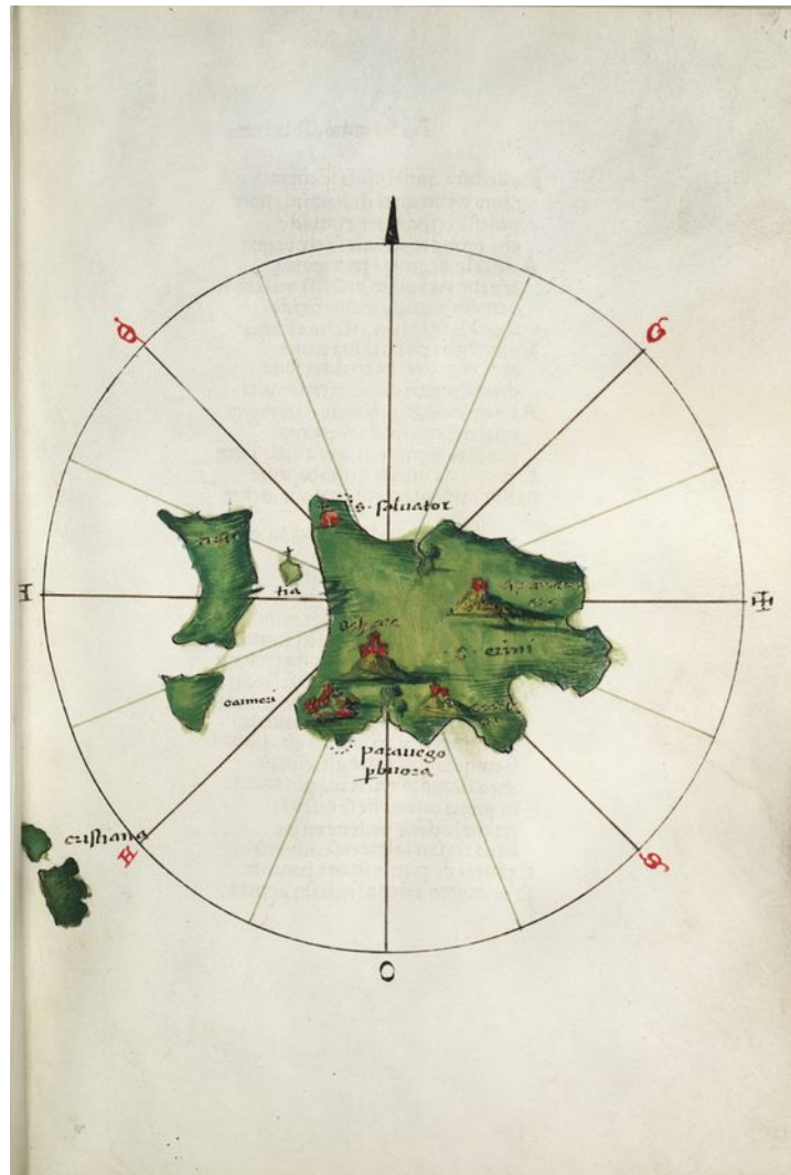
Figure 2. Santorini. Isolario. da li Sonetti. P/21(17) P/21(17).

illustratum ), a world map, and additional chorographic maps of regions and islands (including maps from Ptolemy) in a manner very much like that of an atlas. 4