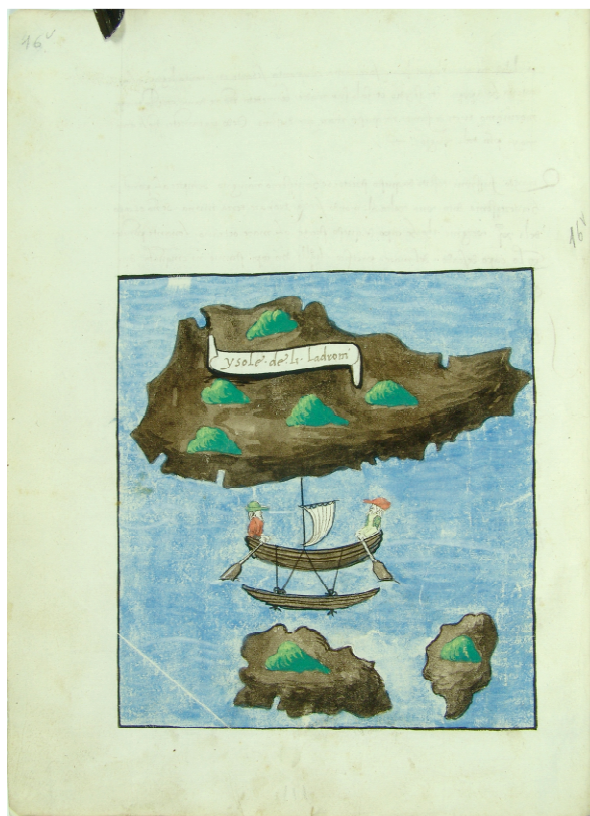
Figure 5. Pigafetta's chart of the three "Islands of Thieves." L103Sup (3).