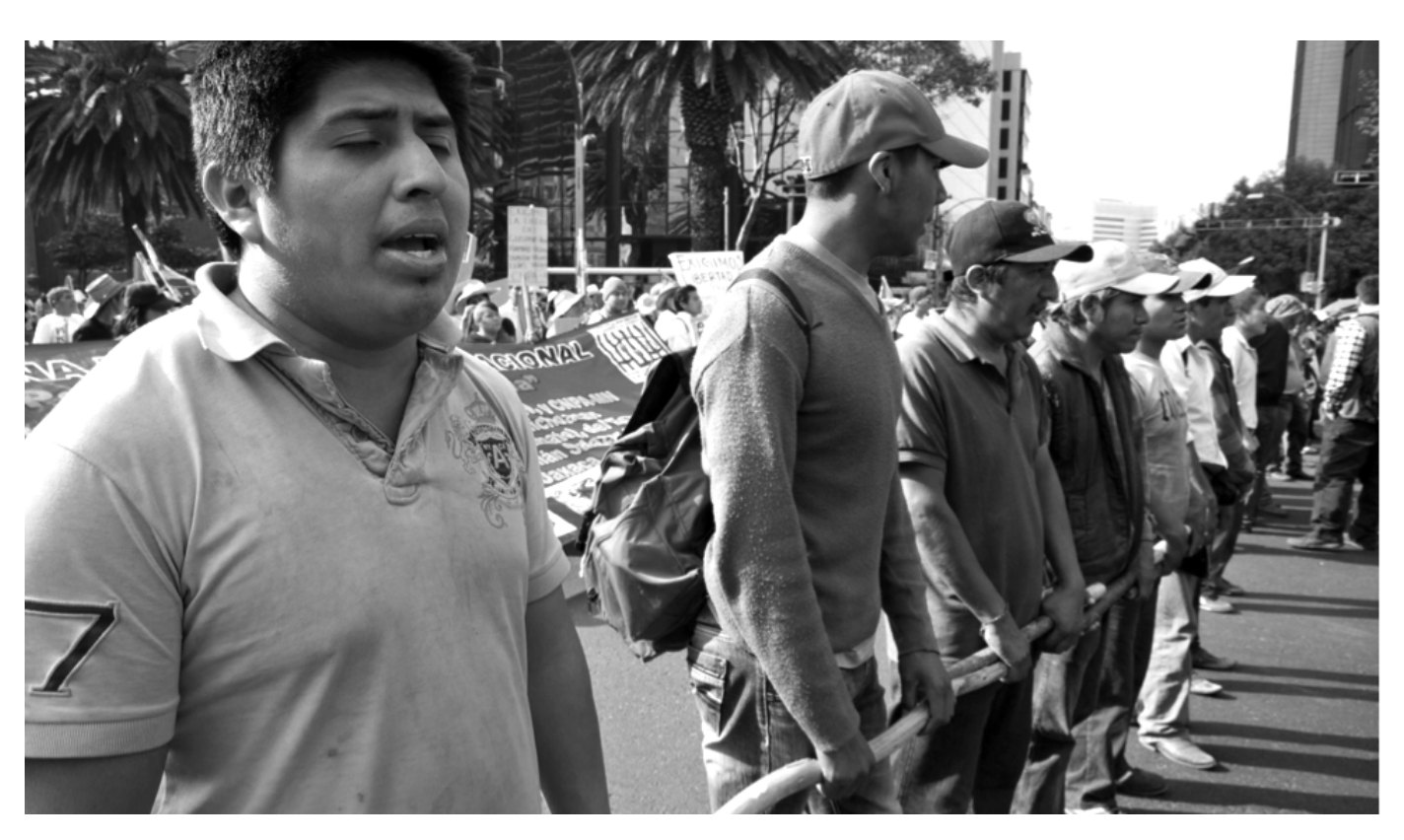
Protesters, Mexico City, January 2014.