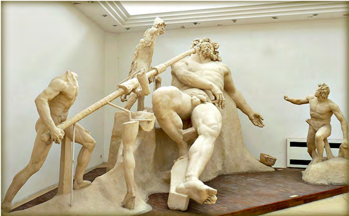
Figure 2. Agesander, Polydorus, and Athenodorus, Blinding of Polyphemus , Sperlonga Italy