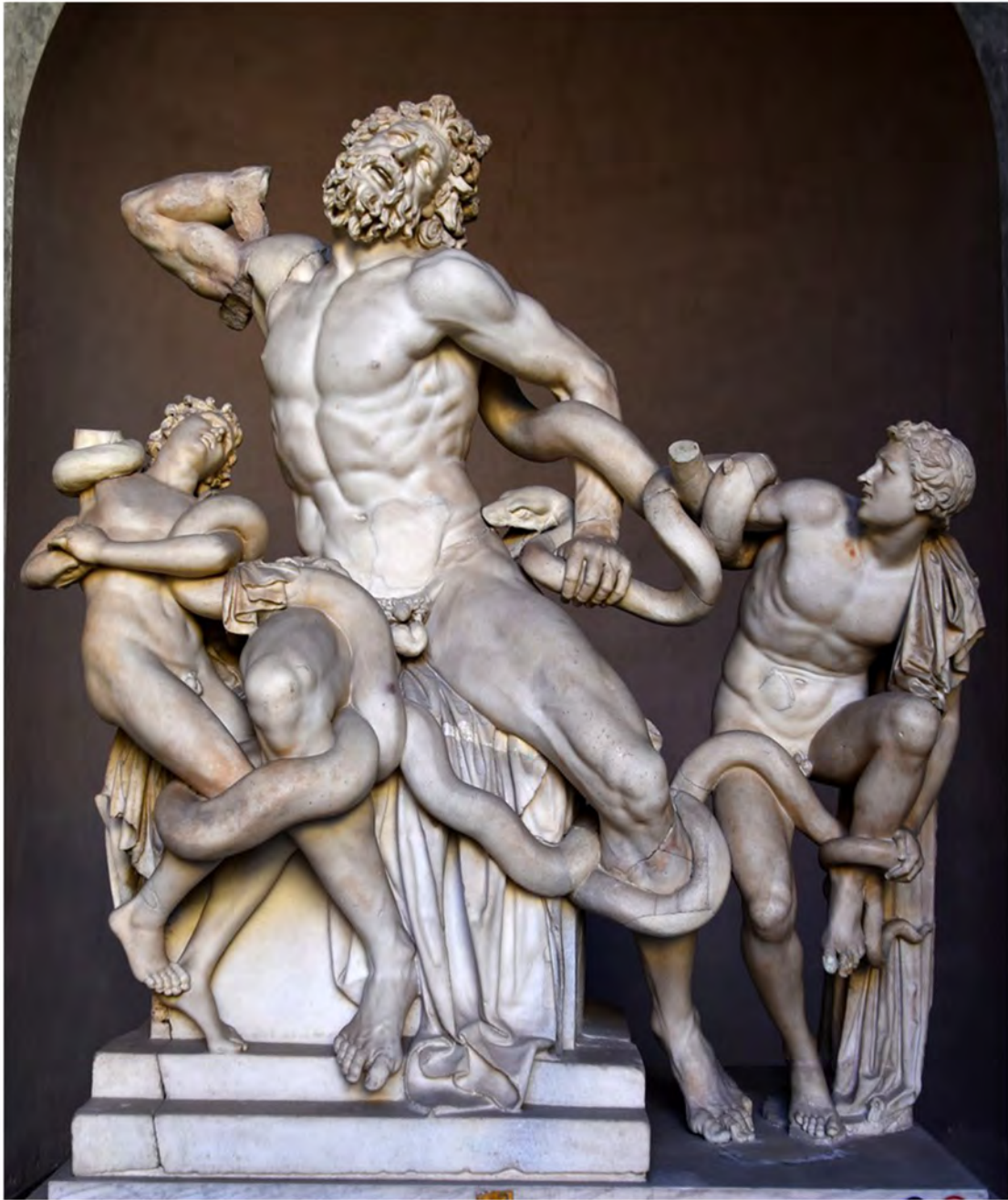
Figure 1a. Laocoön , Magi restoration ca. 1959.