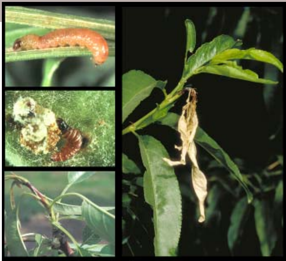
The major pests of cling peaches are oriental fruit moth, upper left , and peach twig borer, left middle . These pests can bore into the terminal of the leaf, lower left , and cause it to wither and die, right . Broad-spectrum insecticides are effective in controlling these species, but can cause other problems such as insect resistance and secondary pest outbreaks.

Most insecticides applied to cling peaches target two key insect pests: oriental fruit moth and peach twig borer. Both are lepidopteran pests that infest the fruit as it matures. Broad-spectrum toxic pesticides such as azinphos methyl, permethrin and esfenvalerate are effective in controlling these species. However, they have other problems such as contamination of surface water due to runoff from orchards, field-worker and pesticide ap-