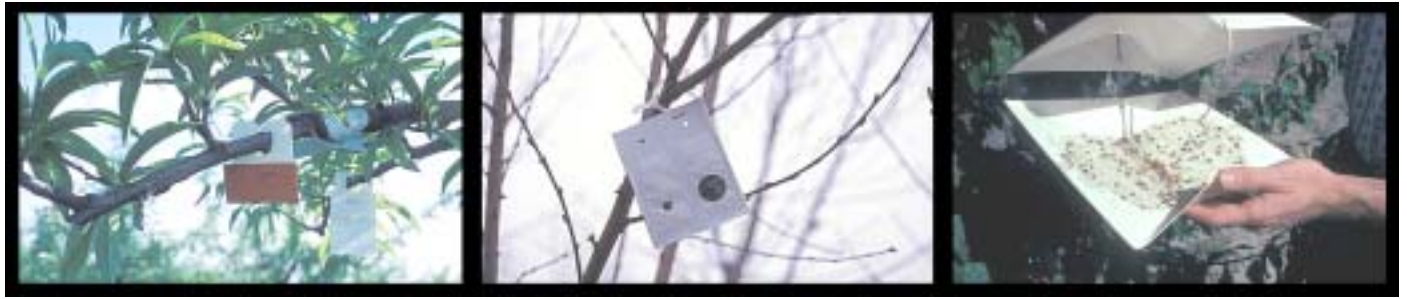
In a demonstration project, cling peach growers in the Sacramento and San Joaquin valleys were introduced to pheromone disruption as a method to control oriental fruit moth and peach twig borer. Several different commercially available products were tested, left and center . Right , A pheromone trap is used to monitor pest levels in the orchard.

each species to determine the application timing.