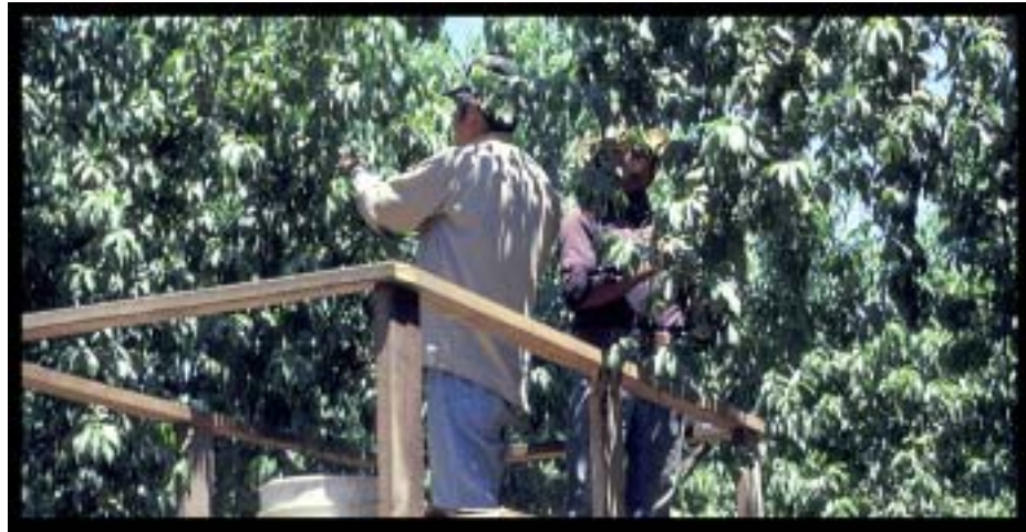
Pheromone dispensers can be placed in the tree using ladders or from a truck, above . Costs for various application methods were measured.

Nonetheless, in Merced County one block caught 228 peach twig borer moths in mating-disrupted orchards and subsequently had substantial damage, indicating that mating disruption was no longer occurring. The populations of peach twig borer are