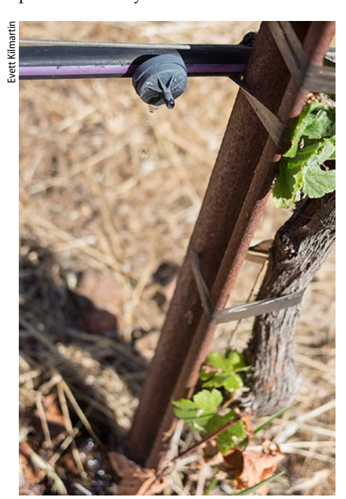
Drip irrigation emitter using recycled water from the Napa Sanitation District.

For recycled water to be a benefit to grape growers, it needs to be suitable for vineyard irrigation and there must be no problems with it (such as high salinity or toxic constituents) that could affect the vines or soil; and growers must be confident about its quality and the effects. In 2004-2005, NSD gave UC a grant requesting a feasibility study. For this study, samples of NSD recycled water were collected