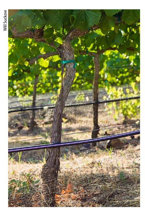
Malbec vines at Trinitas Cellars vineyard in Napa.

Boron. B is an essential element for plants but has a small concentration range between levels considered deficient and those considered toxic. Grapes are particularly sensitive to B in irrigation water and can develop injury to leaves and developing shoots if concentrations