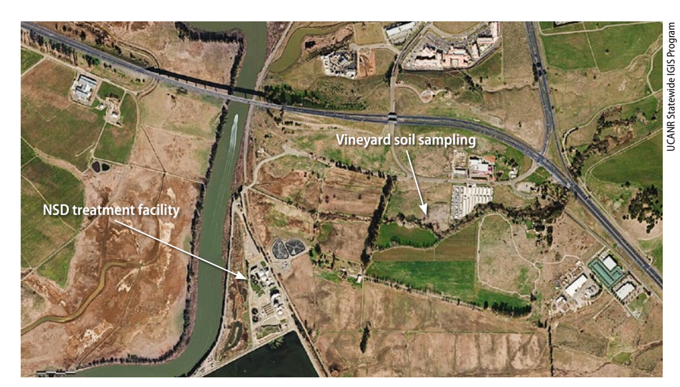
Aerial view of the Napa Sanitation District's recycled water use area and the location of the soil sampling site. The use of treated municipal wastewater for irrigating crops has increased in California in the past 10 years and is expected to expand exponentially in the next few decades.

in 2005 on a weekly basis during the dry season (May 1 through Oct. 31, the period when high-quality recycled water suitable for vineyard irrigation is produced by NSD). Water samples were collected from a 24-hour automatic sampler that maintains a representative sample of recycled water produced at the plant during the previous 24 hours. The sampler collects aliquots every 15 minutes. The quantity collected is based on the flow rate during that period. In this way, a truly representative, composite sample is produced. The samples were collected by NSD staff and sent to Caltest Analytical Laboratory in Napa for determination of key inorganic constituents.