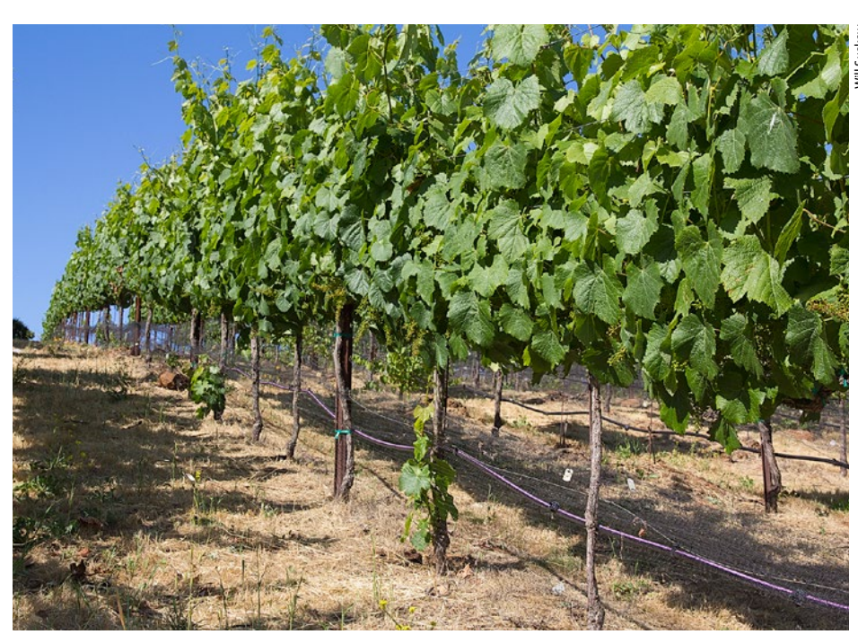
A study by UC Cooperative Extension researchers found that vineyards in Napa County irrigated with reclaimed wastewater showed no buildup of salinity or ion toxicity after 8 years.

With this goal in mind, the Napa Sanitation District (NSD) has developed a Recycled Water Strategic Plan to explore options to maximize water recycling in Napa County; the plan includes