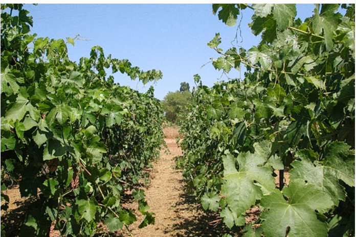
Vines that receive fertilizer applications balanced with their needs, left, show no excess vigor. Vines given too much N produce too much vegetation, right, which can lead to reduced yield and lowered wine quality. The N content of recycled water must be taken into account to keep vines in balance.

and processes of vines, and also of fermentative microorganisms, which can influence quality components in the grape and thus the wine (Bell and Henschke 2008).