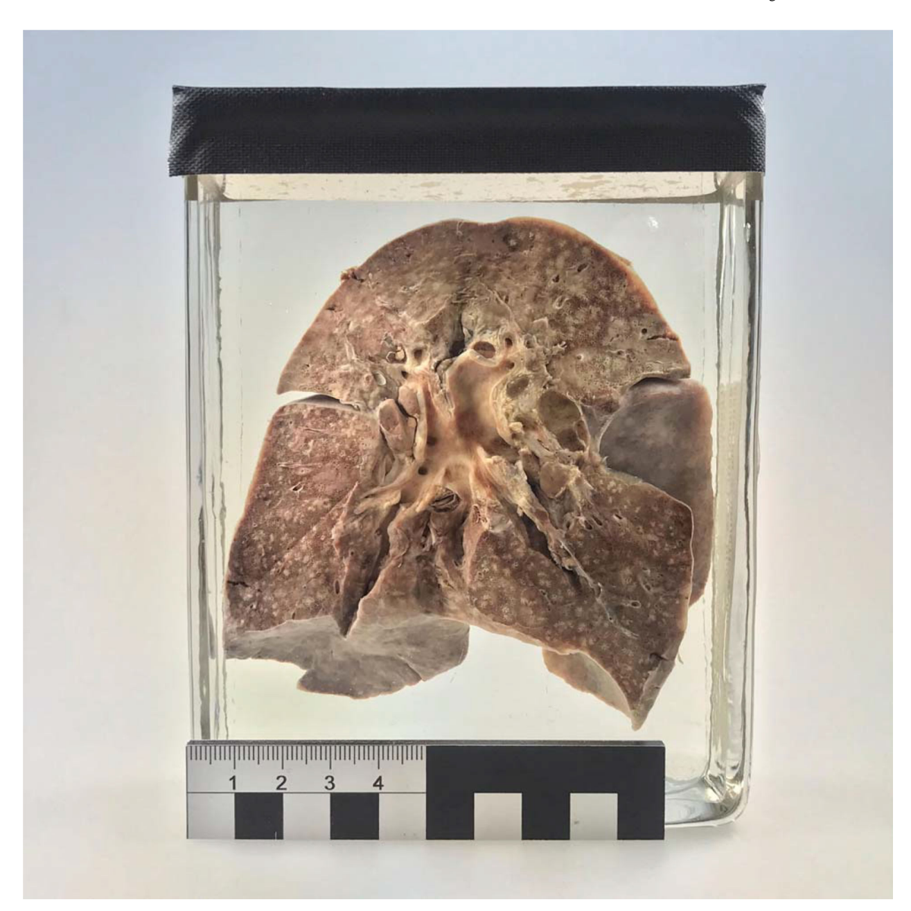
Fig. 1. Formalin-fixed lung specimen collected in 1912 in Berlin from a 2-year old girl diagnosed with measles-related bronchopneumonia (museum object ID: BMM 655/1912).