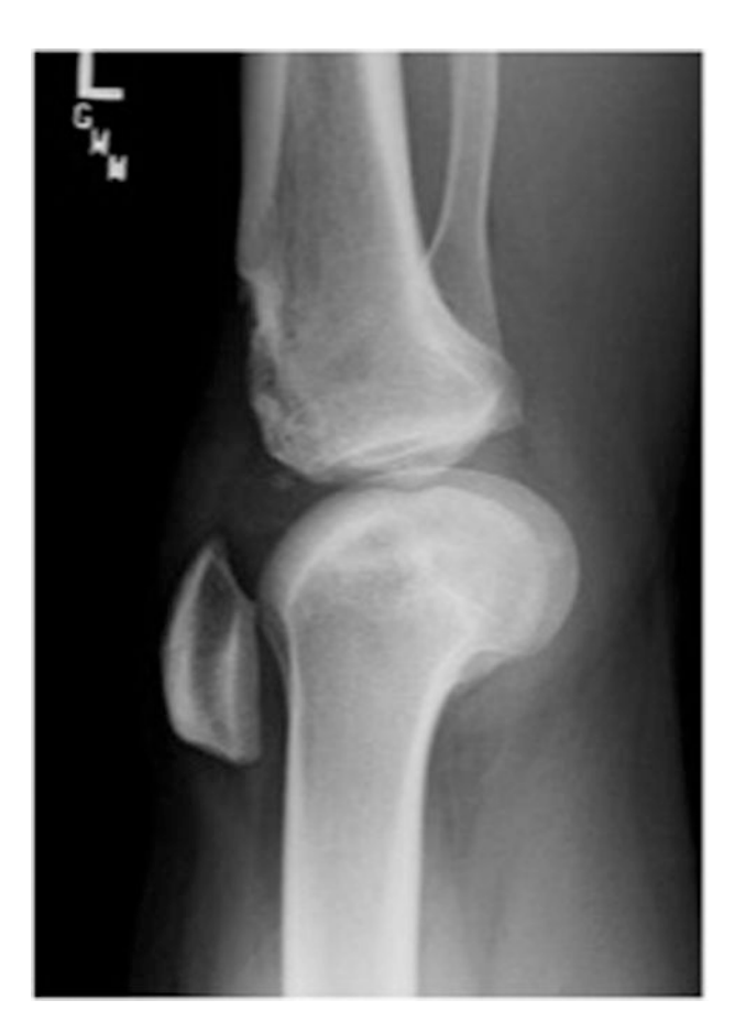
Figure 1. Case #1. Selected radiographic views: 1a: Weight bearing anteroposterior; 1b: 45° flexion-weight bearing (Rosenberg); 1c: 30° lateral; 1d: Full extension lateral. Selected questions pertaining to tunnel location and number of corresponding "Yes" or "No" responses: