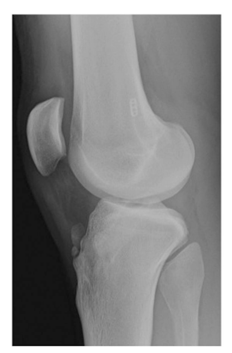
Figure 2. Case #2. Selected radiographic views: 2a: Weight bearing anteroposterior; 2b: 45° flexion-weight bearing (Rosenberg); 2c: 30° lateral; 2d: Full extension lateral. Selected questions pertaining to tunnel location and number of corresponding "Yes" or "No" responses: