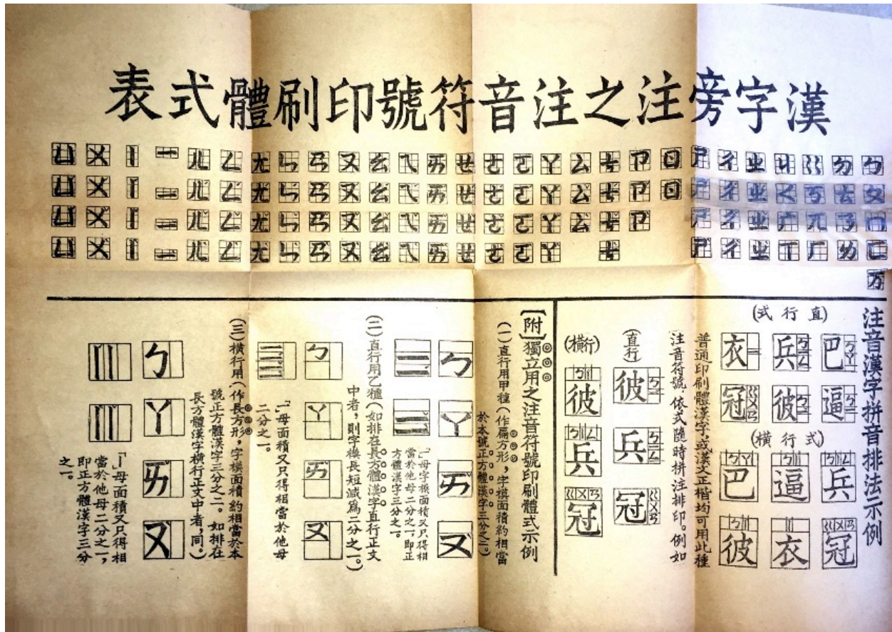
Figure 2. “Type Specimen for Phonetic Symbols Placed Beside Chinese Characters” (漢字旁注之注音符號印刷體式表) from Sound-Annotated Characters (注音漢字 Zhuyin Hanzi ) by Li Jinxi (foldout insert between pages 16 and 17). This table illustrates the printed form of each of the phonetic symbols and how the tones are to be indicated (the first tone was unmarked; the second, third, and fourth tones were indicated with the signs used today in both zhuyin and pinyin to the upper right of the relevant symbols). Additionally, the table shows how the symbols should be printed alongside Chinese characters as ruby characters for both vertical and horizontal text (lower right), and also how phonetic symbols could be printed independently (lower left) (Li J. 1936, 16–17).