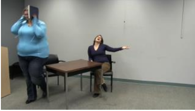
Figure 1: Causee leaves when causer sings poorly