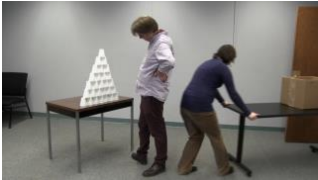
Figure 2: Causee knocked into cups by causer with cart

Intentionality was indicated by obvious body language on the part of the actor, including whether or not they looked at the causee or touched them with their hands in a manner that appeared to be controlled. For example, in an 'unintentional' clip, a Causer walks into a room without looking at the causee and loudly sneezes, which causes a startled Causee to tear a piece of paper. In the contrasting 'intentional' clip, the Causer looks at the Causee and deliberately pushes them, causing them to tear the paper. Four of the training items featured scenes that fit the same parameters as the test items. The remaining six items featured actions on which the two actors collaborate, events that occurred without the involvement of either actor, and events in which one actor destroyed an object while the other looked on.