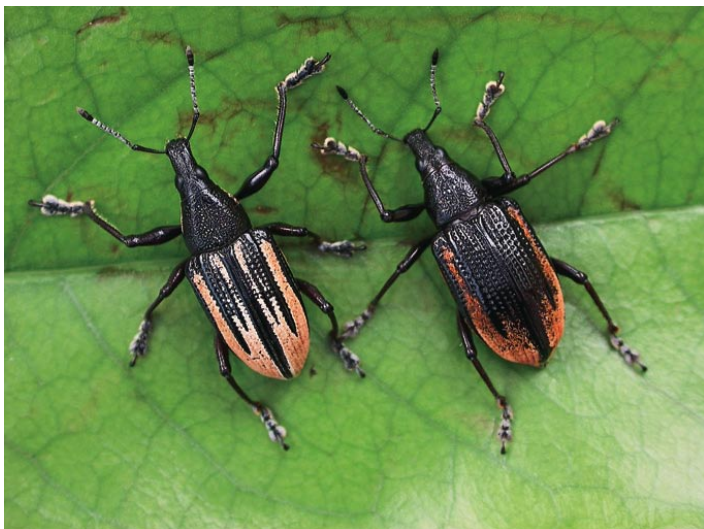
Figure 1. Diaprepes root weevil adults vary in color and striations.

Diaprepes root weevil feeds on more than 270 species of plants from 59 plant families (Simpson et al. 1996). Some of the more common hosts are citrus (all varieties), peanut, sorghum, guinea corn, corn, Surinam cherry, dragon tree, sweet potato, sugarcane, panicum grasses, coffee weed (sesbania), and Brazilian pepper. Because of its broad host range, the Diaprepes root weevil poses a great threat to citrus and ornamental plant industries in California.