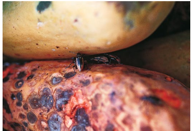
Figure 11. Papaya fruit feeding by adults.

Adult Diaprepes weevils feed along the edges of leaves, creating semicircular notches (figs. 8–10). They prefer young, tender leaves over older leaves. On rare occasions, adults may feed on fruit. Fruit feeding is usually limited to papaya (fig. 11) and citrus (fig. 12). Damage caused by adult weevils is similar to damage caused by other citrus weevils such as Fuller rose beetle ( Asynonychus godmani ), so it is important to locate and identify the weevil that is causing the damage. In addition to notching, Diaprepes adults leave frass scattered on the leaves (fig. 13). Adults are sometimes difficult to find because they feed during the early morning and late afternoon, hiding in the foliage during the day. However, they may be dislodged by shaking the foliage over a light-colored cloth. The trees on which the feeding damage is seen are the trees that should be sampled. In citrus groves with well-established populations, weevils may be found on every tree or sometimes aggregated on just a few trees.