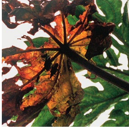
Figure 9. Papaya leaf feeding.