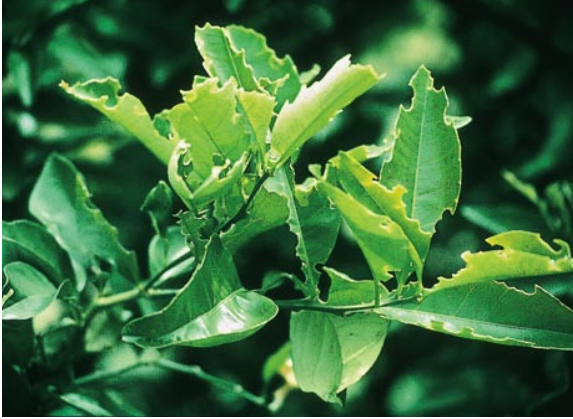
Figure 8. Citrus leaf feeding by Diaprepes adults.