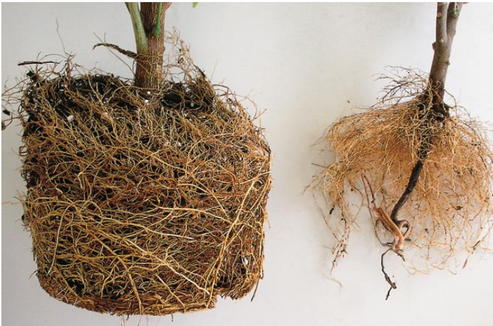
Figure 16. Loss of root hairs due to Diaprepes feeding (right), compared with normal roots (left).