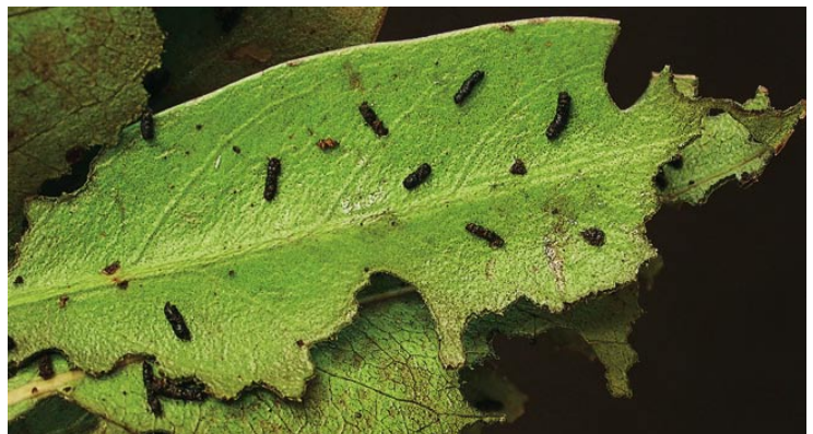
Figure 13. Frass (excrement) left behind by feeding adults.