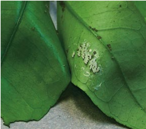
Figure 4. Cluster of Diaprepes eggs deposited between leaves.