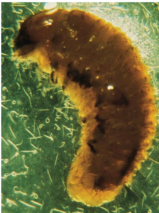
Figure 23. Diaprepes larva killed by nematodes.

Entomopathogenic nematodes, both native and commercially available, have been found to cause significant mortality to Diaprepes root weevil larvae in sandy soils in Florida and the Caribbean (McCoy et al. 2000) (fig. 23). The nematodes are ineffective in heavier, clay loam soils with a small particle size. This lack of effectiveness may be due to the inability of the nematodes to move through the smaller pore spaces found in the heavier soils.