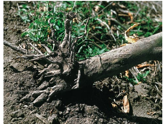
Figure 17. Eventually, Diaprepes may girdle the crown of citrus.