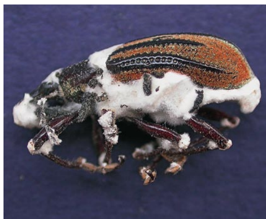
Figure 24. Adult Diaprepes killed by fungi.

In field trials, the entomopathogenic fungus Beauveria bassiana applied as a soil drench killed larvae and newly emerging adult root weevils (fig. 24), but the fungus had limited persistence in the soil and required application rates that were cost-prohibitive. Studies are underway to induce outbreaks of this fungus in adults.