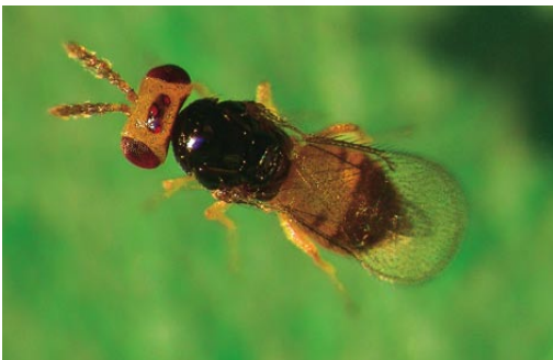
Figure 22. A parasitic wasp ( Aprostocetus vaquitarum ) that attacks Diaprepes eggs.

A number of species of small parasitic wasps that attack the egg stage of the Diaprepes root weevil were collected from the Caribbean and released in Florida from 1998 to 2001 (Hall et al. 2001). Two of the parasites, Aprostocetus vaquitarum (fig. 22) and Quadrastichus haitiensis , have become established. The levels of parasitism in southern Florida range from 70 to 80 percent. However, in central Florida, parasitism is only 5 percent. This variability may be due to differences in winter temperature or differences in application of various pesticides.