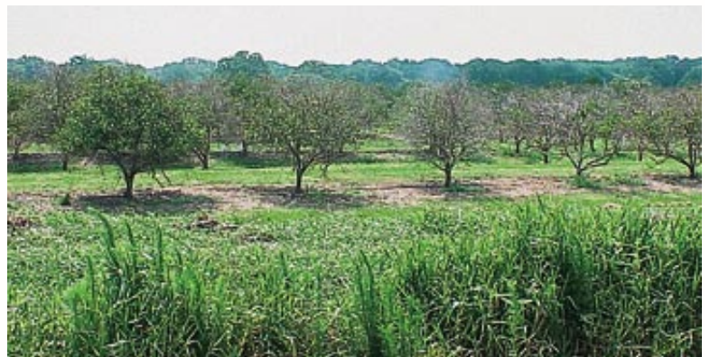
Figure 18. Citrus trees declining due to a heavy infestation of Diaprepes root weevil in Osceola County, Florida.

Larvae of the Diaprepes root weevil cause extensive damage to their host plants by feeding on the roots, tubers, or other underground portions. In cassava and potatoes, the larvae feed directly on the tubers (figs. 14–15). In citrus, they begin by feeding on the smallest roots, and as the larvae grow, they move to the larger structural roots (fig. 16). Eventually they may girdle the large lateral roots or the crown area of the tree (fig. 17). In laboratory studies, citrus rootstocks commonly used in the United States showed no resistance or tolerance to feeding by Diaprepes root weevil larvae. Many citrus trees do not show symptoms of decline (e.g., leaf yellowing, wilting, defoliation, etc.) until extensive damage has been done to the root system (fig. 18). Damage is particularly serious in groves where trees are planted in poorly drained soils that