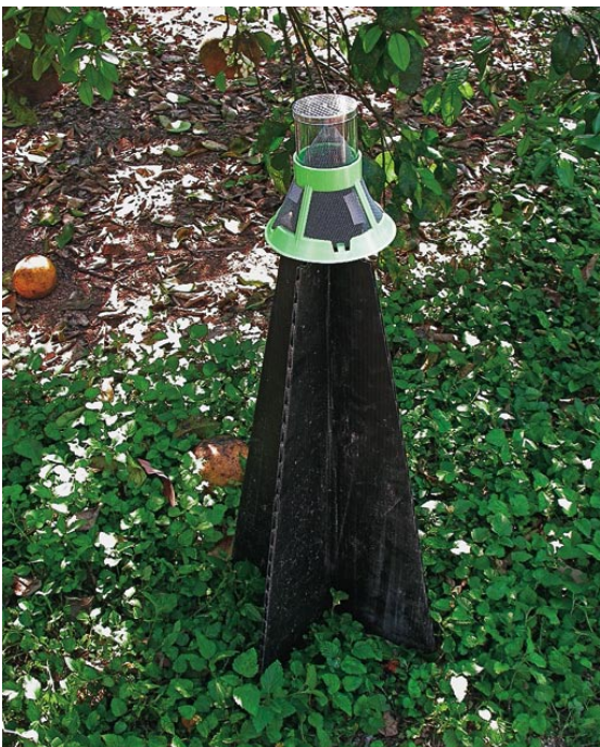
Figure 21. A Tedders ground trap captures adults as they emerge from pupating in the soil.

are optimal for larval development (McCoy 1999). The feeding activity of the larvae may also make the plant more susceptible to root rot organisms such as Phytophthora spp. (Graham et al. 2002).