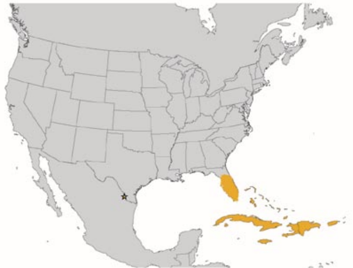
Figure 2. Current distribution of Diaprepes root weevil. Note population in South Texas.