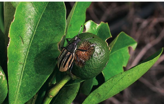
Figure 12. Citrus fruit feeding.