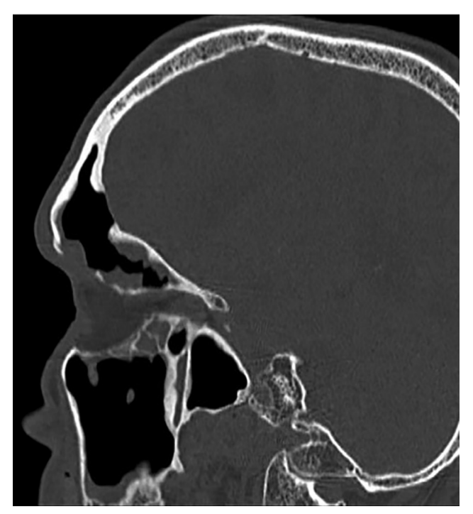
Figure 4. Postchemotherapy computed tomography of the sinuses demonstrates near resolution of the left frontal sinus mass; areas of supraorbital and posterior table dehiscence are evident.

there was a large area of posterior table erosion, with dural pulsations visible through the mucosa and no intervening bony layer, although there was no frank intracranial connection. The final pathology results showed only IP without squamous cell carcinoma in situ or dysplasia. The patient had been followed up every 1–2 months as an outpatient and remained recurrence free at 1 year after surgery, with good overall functional status after recovery from chemotherapy.