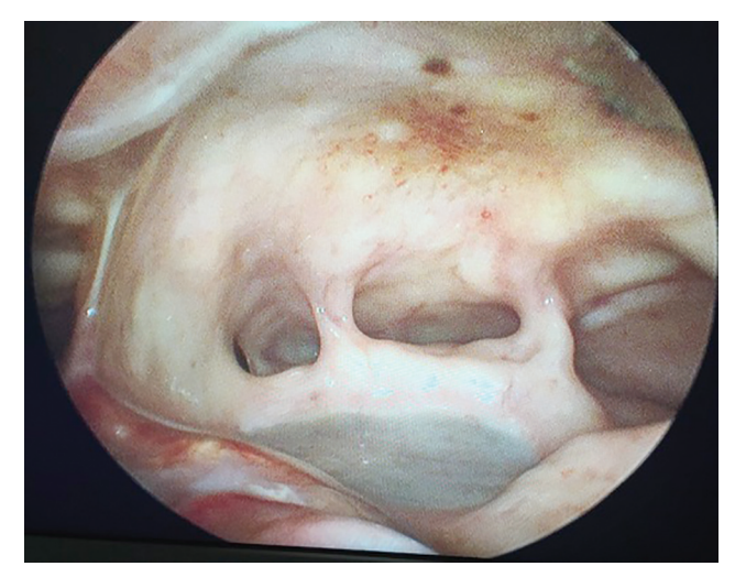
Figure 5. Postoperative endoscopy of the Draf III cavity demonstrated mucosal healing but no evidence of recurrent disease, with a visible dehiscence of the posterior table of the frontal sinus.

Most IP cases can be effectively treated, even cured, by endoscopic sinus surgery alone. In contrast, previ-