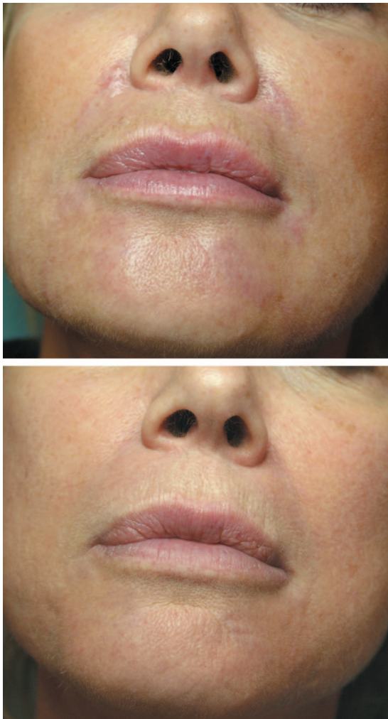
Fig. 1. (Above) Sclerosing granuloma (Arteplast) 10 years after injection, 2 weeks after severe bronchitis, and 3 days after onset. (Below) Complete resolution 10 days after intralesional injection of 160 mg of methylprednisolone and four sessions of intense pulsed light.