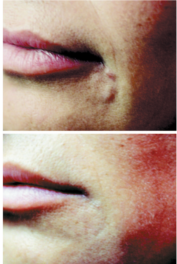
Fig. 4. (Above) Sclerosing granulomas (New-Fill) in both marionette lines developed 18 months after injections. These granulomas grow to a small size only, probably due to the small amount of polylactic acid injected, but they can remain for years if left untreated. (Below) Appearance after effective treatment with three injections of 5 mg of undiluted betamethasone intralesionally.

The pure mixture of intralesional 5-fluorouracil (here 1.6 ml of a 500 mg/10 ml 5-fluorouracil solution) with 0.4 ml of betamethasone (7 mg/ml) decreases cell proliferation and invasion and releases collagenase activity within the granuloma. 38 From their 9-year experience in treating hypertrophic scars, Fitzpatrick and Manuskiatti 63 and Narins et al. 65 recommend pure 5-fluorouracil (50 mg/cc) intralesionally or mixed with 1 mg/cc of Kenalog. Frequent initial injections administered one to three times per week were more efficacious than higher single doses. Besides inhibiting tumor growth, cytostatics also inhibit collagen synthesis and are effective in the treatment of keloids and hypertrophic scars. Bleomycin (1.5 IU/ml) has been injected intralesionally into keloids and hypertrophic scars and should work successfully in granulomas as well. 57,66