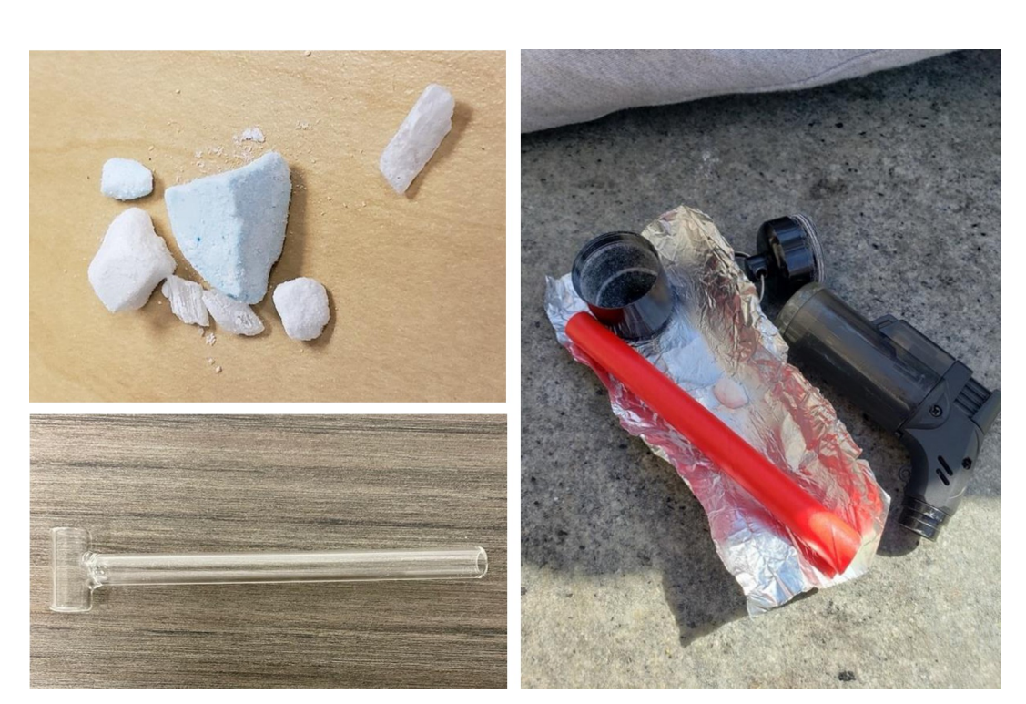
Fig 1. Fentanyl, typically sold in compressed powder chunks, (and a few methamphetamine shards) and the materials commonly used to consume them via inhalation.

https://doi.org/10.1371/journal.pone.0303403.g001