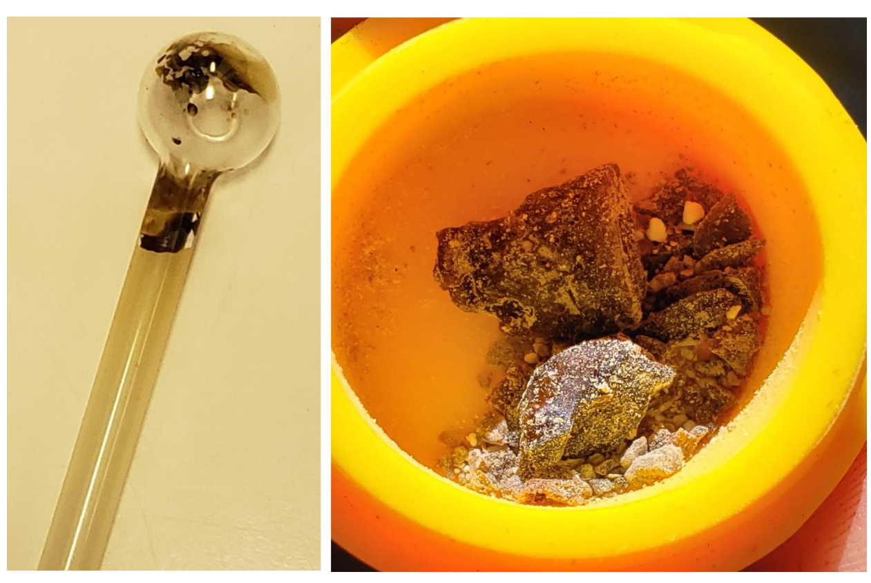
Fig 4. Resin buildup on equipment and collection in containers.

https://doi.org/10.1371/journal.pone.0303403.g004