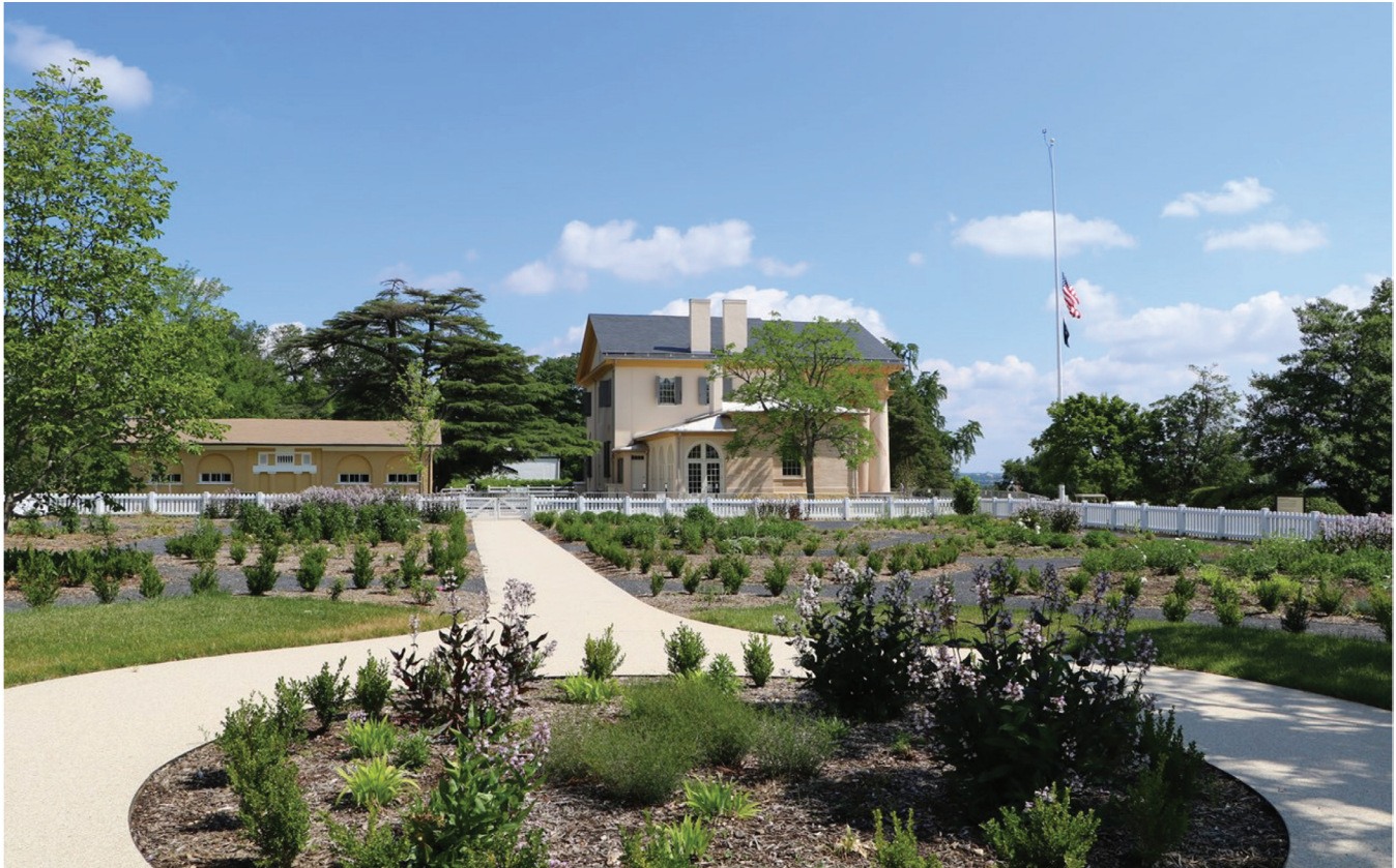
The main house is far more prominent in the landscape than the smaller buildings in the rear of the property.

Arlington has always reflected America at its best and its worst. It's a place to reflect on the immeasurable patriotic sacrifices of American service members. It's also a place to reflect on the legacies of enslavement and the long-term exclusion of African Americans from dominant historical narratives. As Americans continue to struggle with the legacies of slavery, the Civil War, and the flawed reconciliation that followed, Arlington will no doubt continue to be a cultural battleground and an enlightening classroom—a place where American history continues to be discovered, reinterpreted, and fought over. 21