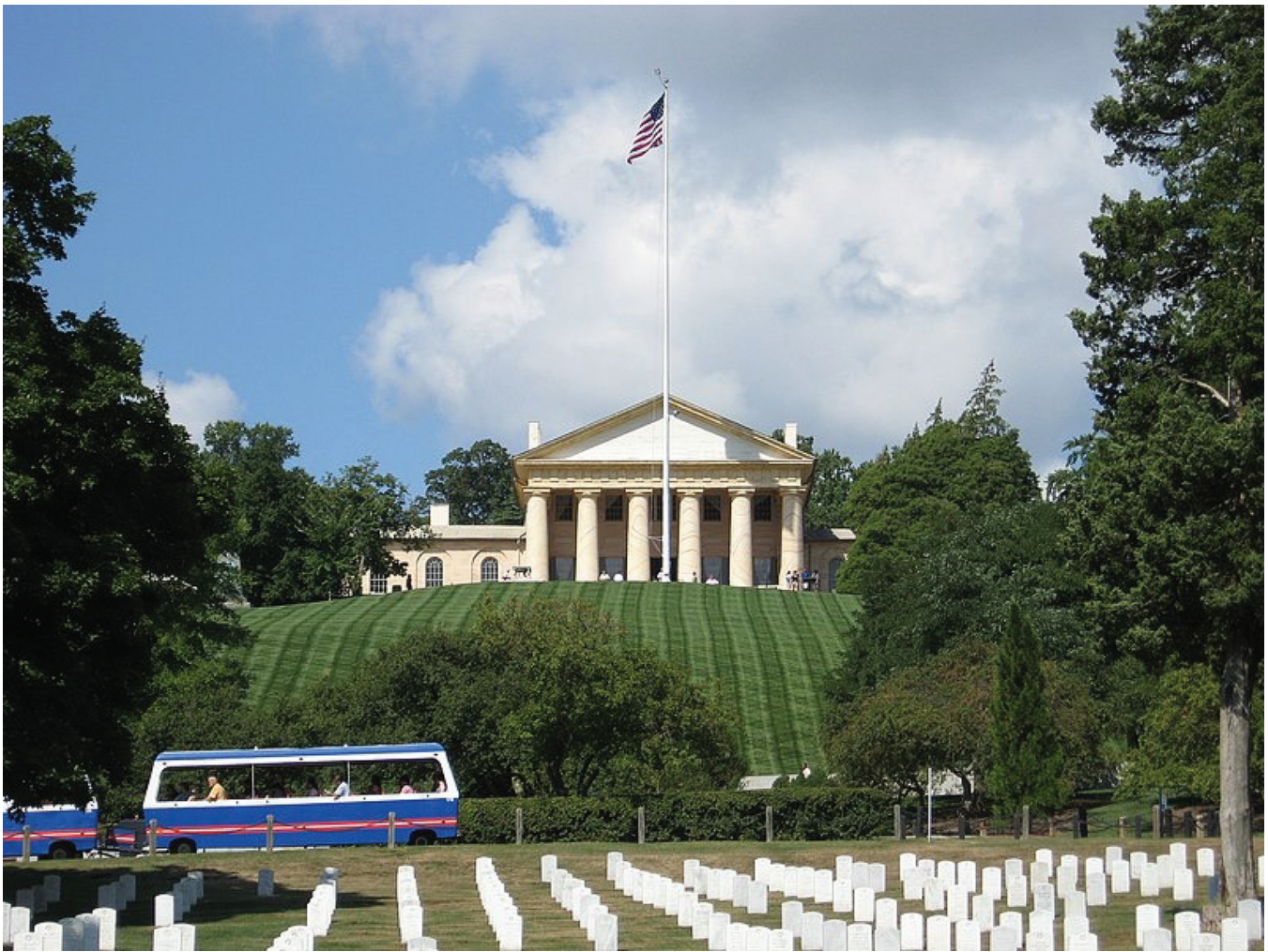
Arlington House.

this place that he departed two days later to begin his four-year fight for Virginia and the Confederacy. He never returned. 2