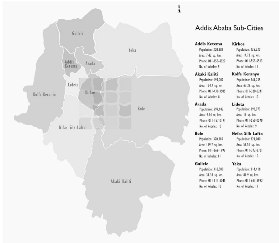
Map 1: Sub-cities of Addis Ababa 6

neighbors as one might assume in a larger sub-city. However, these numbers become important when thinking about the distance that is now put between someone who is moved from Lideta sub-city to Akaki- Kaliti sub-city and someone that has been relocated to Gullele sub-city.