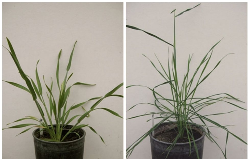
Fig. 2 Two most frequent phenotypes among aneuploid C_0 plants recovered via androgenesis in hexaploid triticale ( XTriticosecale Wittmack): on the left Nulli 2R (‘Curly’ phenotype); on the right Nulli 5R (‘Narrow’ phenotype)

While most material analyzed here was pre-selected based on plant morphology, seed set and seed quality, one hybrid combination, Presto \times Mungis, was studied in its entirety in its second generation. No colchicine was used so this population of DH is composed strictly of plants resulting from spontaneous chromosome doubling. Of the 1200 green plants regenerated, 207 plants were fully fertile while 27 were partially fertile. Upon self-pollination, progenies of all these plants were grown and subjected to