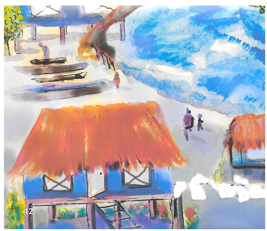
Figure 3. Joyceline Kauc Leahy, "While fishing canoes lay idle in the shade," watercolour illustration in The Lazy Little Frog , 2022. Courtesy of the artist

landmarks, for example a Japanese wartime shipwreck and two local rivers. The opening spread includes a vibrant view of the village on the left and a house on pilings surrounded by hibiscus flowers on the right (Fig. 3). Other illustrated pages include a panorama of the ocean, homes, and canoes, and a scene of Mama Maria the pig and Loki the frog exchanging threats and laughs. <sup>14</sup> The story closes with Loki and Kande Kaks the rooster becoming "best friends" following a series of arguments, name-calling, and adventures.