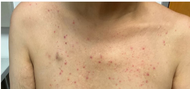
Fig. 2. Generalized cetuximab-associated skin rash. The patient experienced a papulo-pustular eruption during cetuximab infusions distinct from the skin toxicity seen in the groin.

In June 2022, imaging showed recurrent periurethral mass and in July 2022, he was started on weekly cetuximab. In August 2022, he noted an acneiform rash associated with cetuximab on his face and chest for which he was seen by a dermatologist and prescribed topical clindamycin that was subsequently switched to topical BenzaClin (Fig. 2). On cycle 7 of cetuximab, he reported significant scrotal and groin erythema and moist desquamation (Fig. 3). These skin findings were morphologically distinct from the acneiform rash on his face and chest and were similar to the skin toxicity he experienced during his course of radiation 1 year prior. Radiation recall was suspected, and the skin was managed conservatively. The patient returned for a skin check 3 days later with decreased erythema and improving moist to dry desquamation. The dermatitis