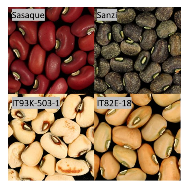
Figure 1. Images of accessions expressing and not expressing red seed coat color. Sasaque and IT93K-503-1 express red seed coat color; Sanzi and IT82E-18 do not.

Three cowpea populations were used for mapping: the UCR Minicore, which includes 368 accessions [24], a MAGIC population consisting of 305 lines [25], and an F<sub>2</sub> population developed as part of this work from a cross between Sasaque (Red, r -1) and Sanzi (Not Red, R -1), consisting of 108 individuals. Example images of the seed coats, including these two accessions, can be found in Figure 1.