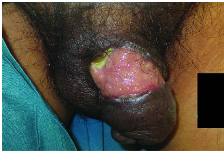
Figure 1. Circumferential full thickness ulcer on the shaft of the penis. Significant edema of the surrounding area extending from the penile tip to the testicles.