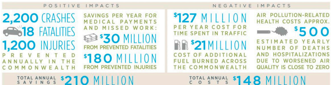
Figure 2. Infographic of estimated total savings and costs under the Speed Limit Bill.